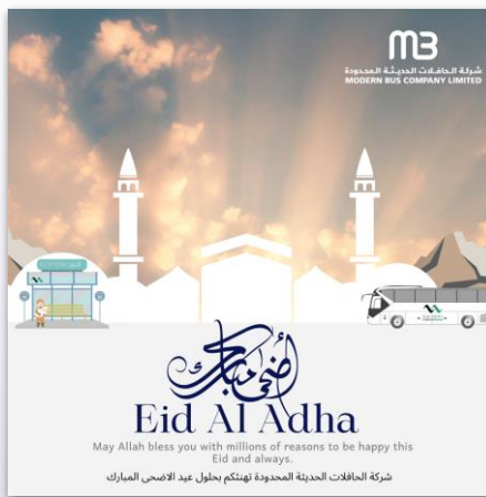
Modern Bus Company celebrates Eid Al Adha.