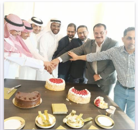
Nesma Water & Energy employees and management celebrate Eid Al Adha.