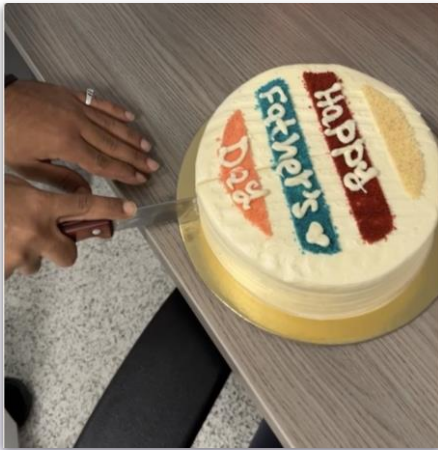
Modern Bus Company celebrates Father's Day.