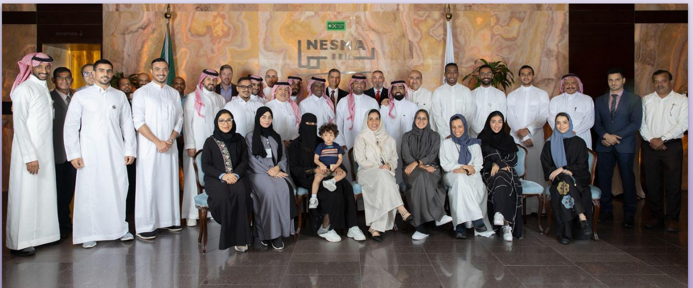
Eid Al Adha was celebrated by Nesma Company employees and management.