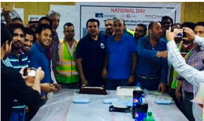
SANG Hospital project, Qassim - Nesma & Partners