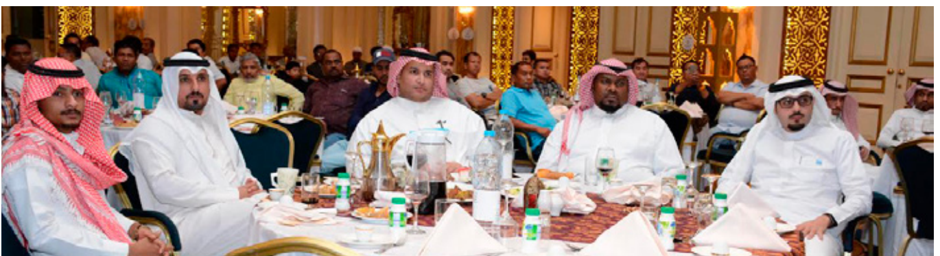
Nesma Electric Riyadh