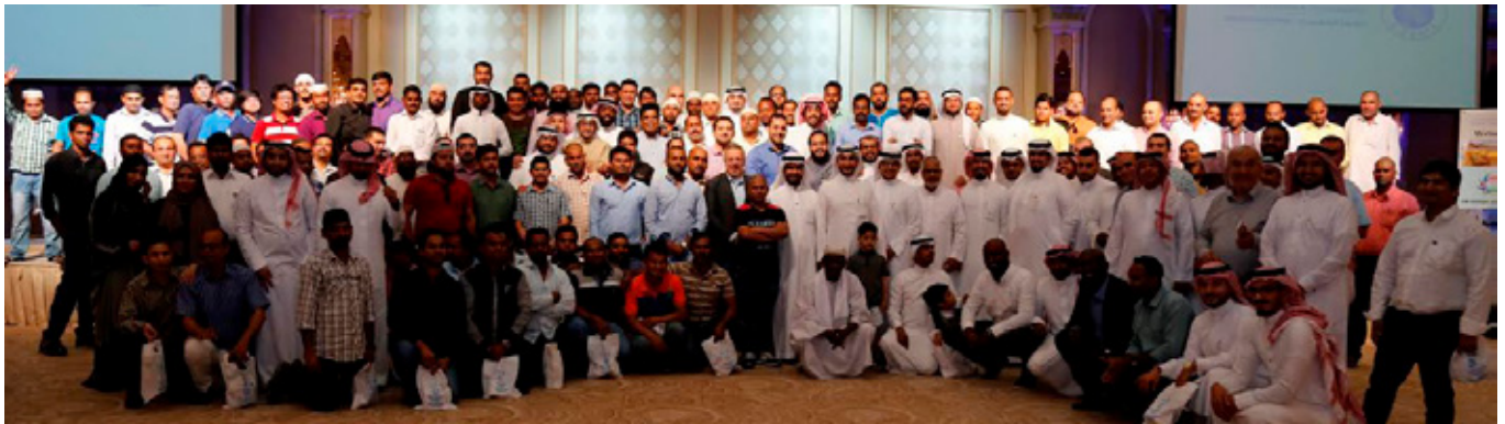
Nesma Electric Jeddah

Across Nesma, employees recently celebrated Ramadan Iftar together.