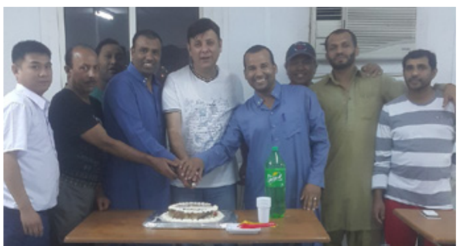
KAFD, Riyadh - Nesma & Partners