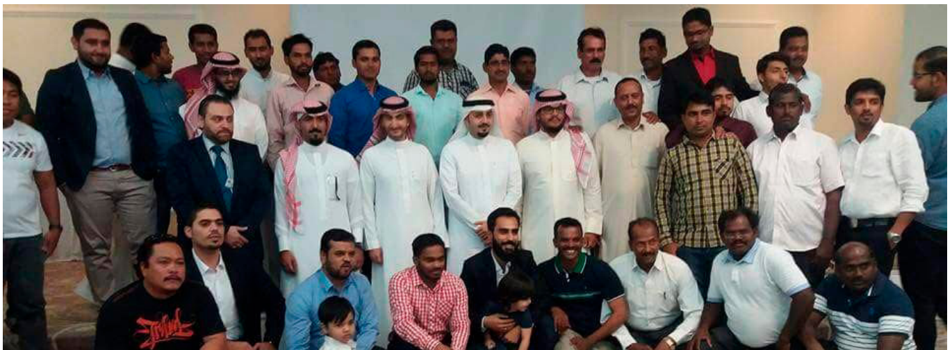
Nesma Electric Dammam