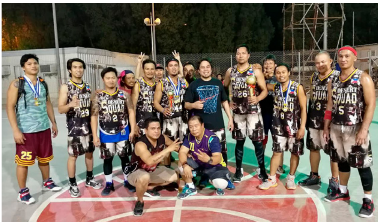
Nesma & Partners celebrating the opening ceremonies of Nesma Jubail Camp 2 Basketball League.