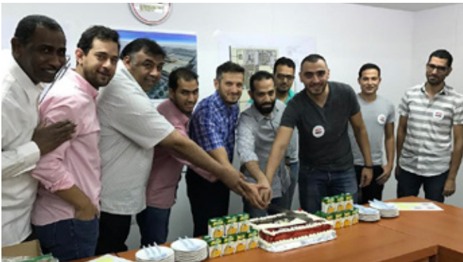
PMO Riyadh - Nesma & Partners