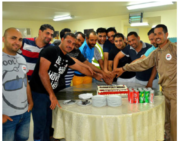
SANG Hospital project, Riyadh - Nesma & Partners