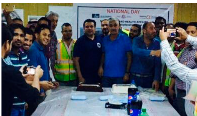
KASH Qassim project - Nesma & Partners