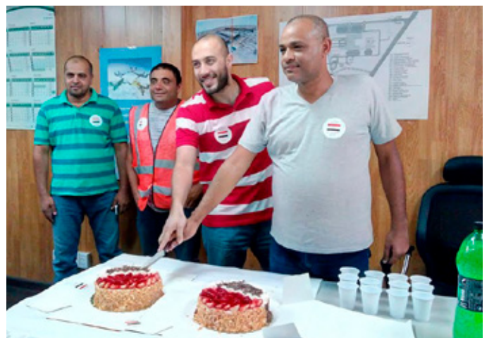
SANG Hospital project, Taif - Nesma & Partners