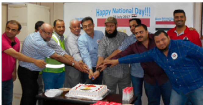
DIRAB Airbase project - Nesma & Partners

Across Nesma, employees recently celebrated the national day of Egypt.