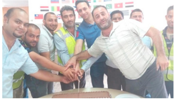
SANG Hospital project, Jeddah - Nesma & Partners