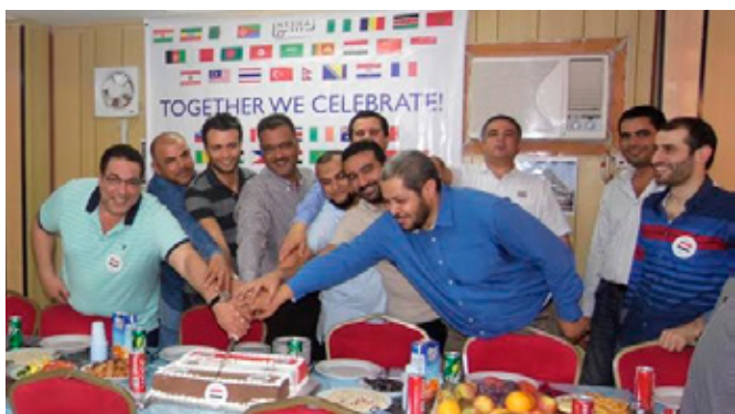
KAAR project - Nesma & Partners