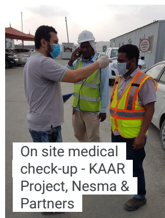
On site medical check-up - KAAR Project, Nesma & Partners