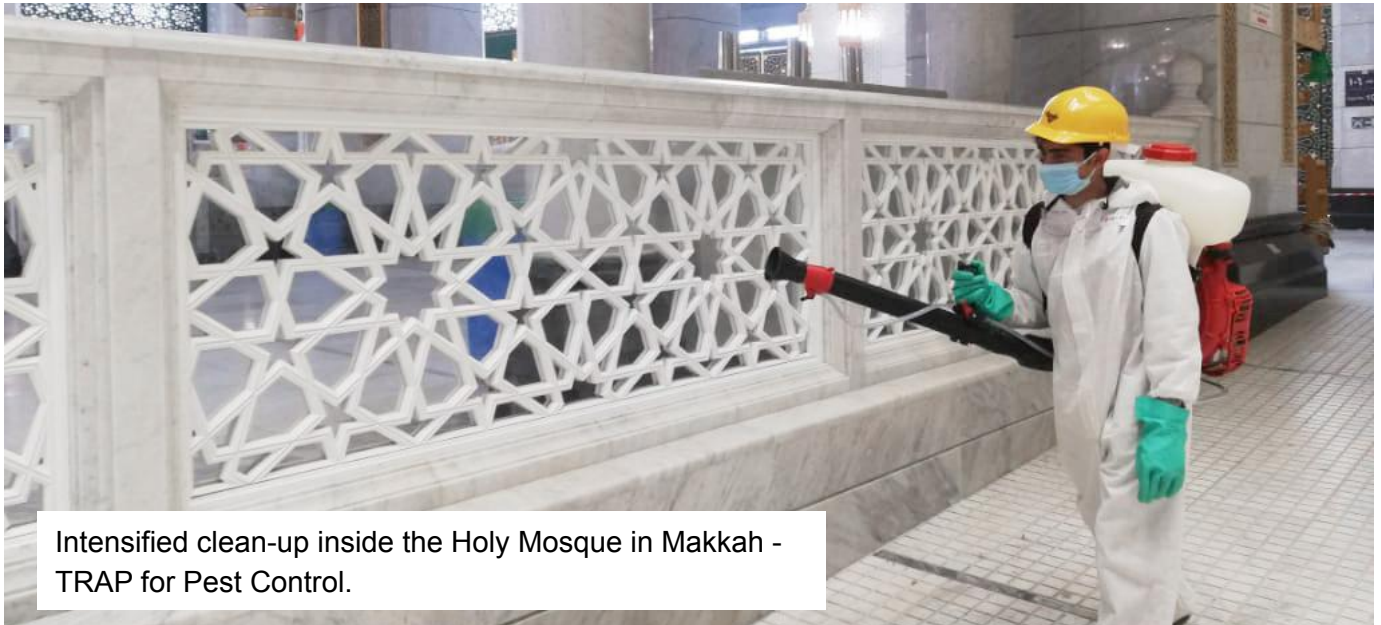
Intensified clean-up inside the Holy Mosque in Makkah - TRAP for Pest Control.