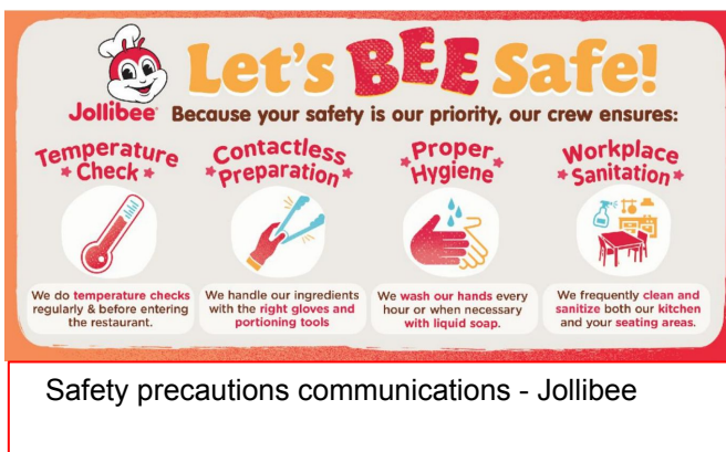
Safety precautions communications - Jollibee