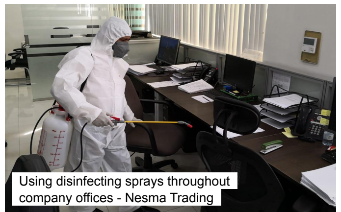
Using disinfecting sprays throughout company offices - Nesma Trading