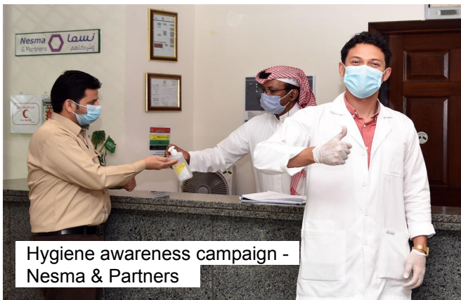
Hygiene awareness campaign - Nesma & Partners