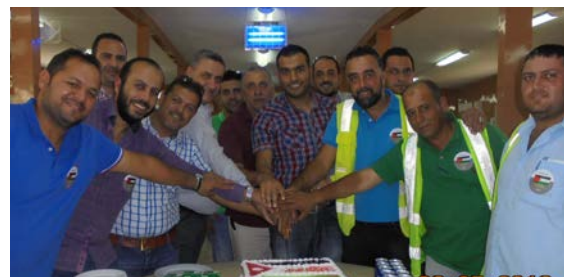
SANG Hospital Jeddah - Nesma & Partners