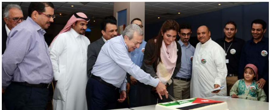
Nesma & Partners Head Office and Nesma Trading