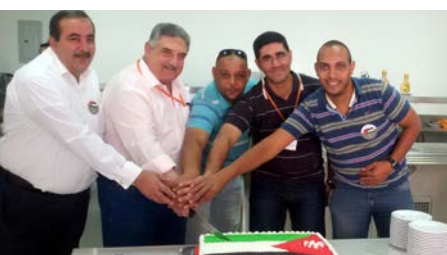
RMC - Nesma & Partners