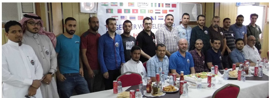
JODC Makkah and KAAR Project