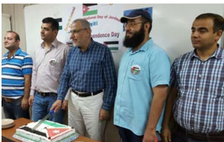
Dirab Airbase - Nesma & Partners