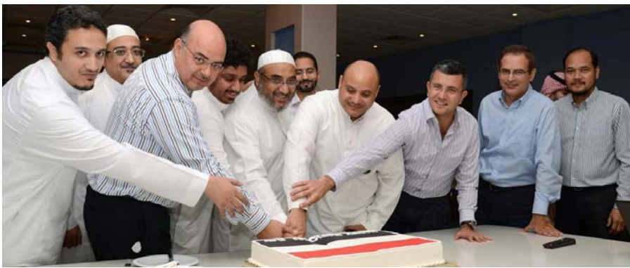
Nesma & Partners Head Office