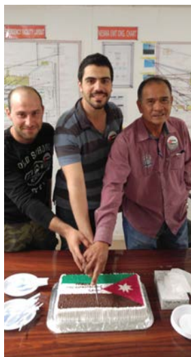
SADARA SPC - Nesma & Partners