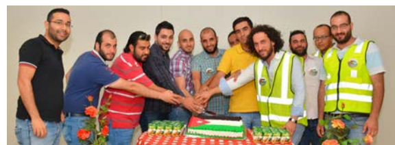
SANG Hospital Riyadh