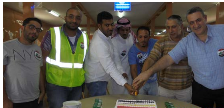
SANG Hospital Jeddah - Nesma & Partners