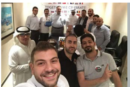
Nesma Telecom & Technology