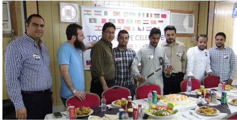
JODC Makkah - Nesma & Partners