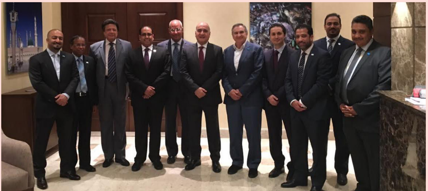
A Nesma Board Meeting took place on April 21-22, 2016 in Egypt.