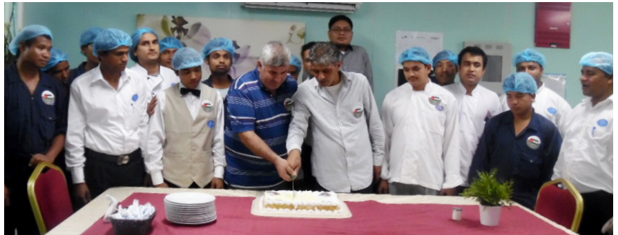
Aramco Jazan Project - Nesma Catering