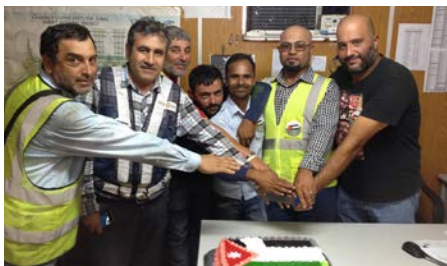
KIC Project - Nesma & Partners