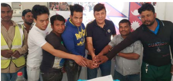
Nesma & Partners - KAFD Project, Riyadh.