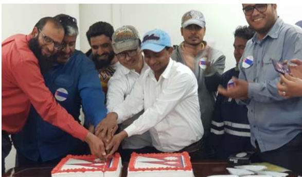
Nesma & Partners - Onshore Maintain Potential project