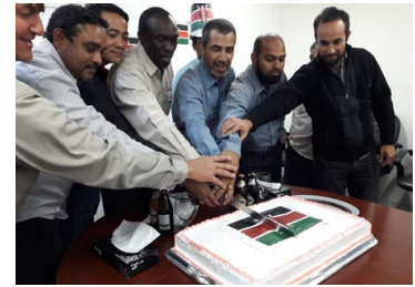
Nesma & Partners - Haradh OMPP SA2 recently celebrated the national day of Kenya.

Across Nesma, employees recently celebrated the national day of Nepal