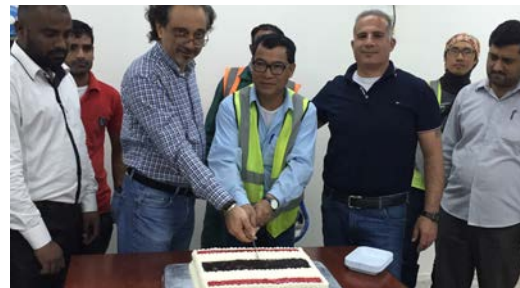
Nesma & Partners - KAUST Project recently celebrated the national day of Thailand.