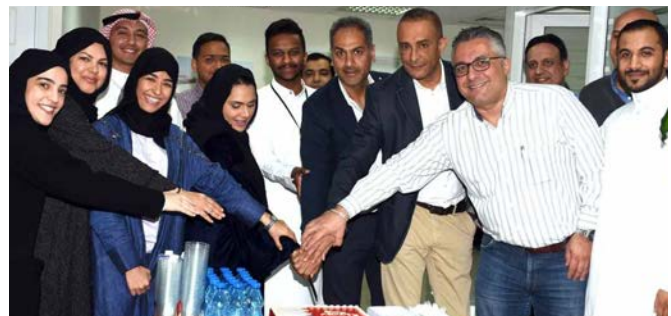
Nesma & Partners Head Office recently celebrated the national day of Bahrain