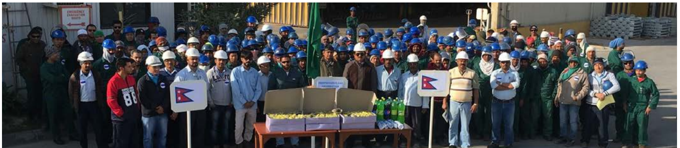
Nesma & Partners - Fab shop project, Dharan

Across Nesma, employees recently celebrated the national day of Nepal