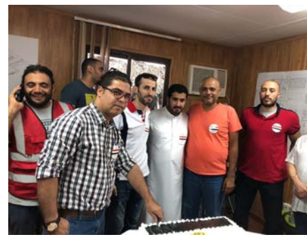
Nesma & Partners - SANG Hospital, Taif