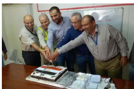
Nesma & Partners - FIB & FCW