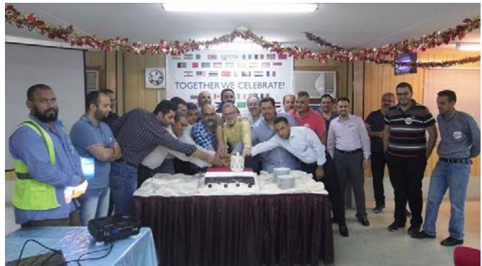
Nesma & Partners - KAAR Project, Makkah