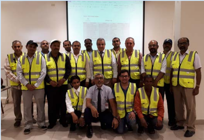
Fire and safety training sessions were held for Nesma Village and Atheeb Village employees in Khobar. The sessions aimed to implement HSE standards at all Nesma compounds.