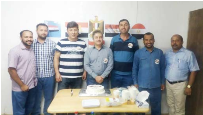
Nesma & Partners - KAFD