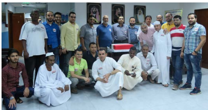
Namma International Marine Service