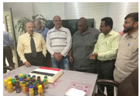
Nesma Electric, Riyadh