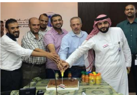
Nesma Electric, Jeddah