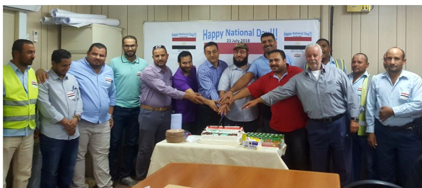
Nesma & Partners - DIRAB AIRBASE