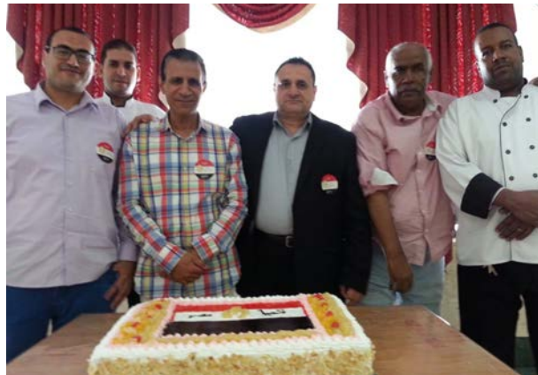
Mawaddah Int'l Group for Hotel & Umrah Services, Madinah