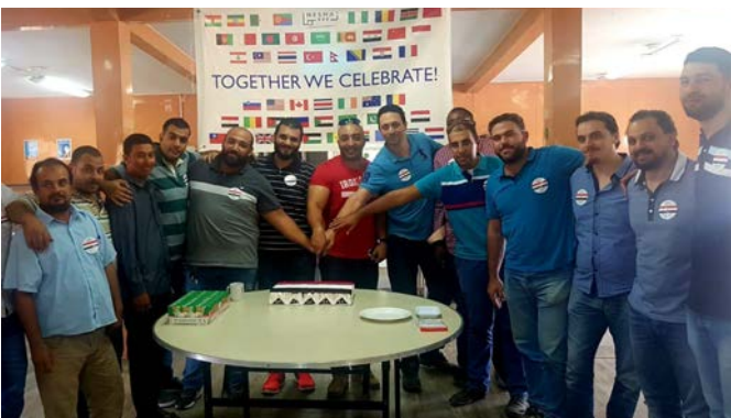
Nesma & Partners - SANG Hospital, Jeddah