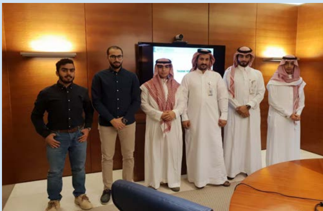
This month Nesma Holding held induction programs for new employees in Riyadh, Jeddah, and Alkhobar.