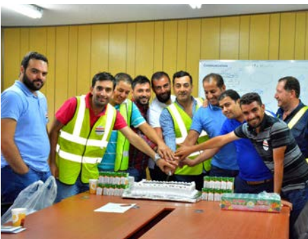
Nesma & Partners - SANG Hospital, Riyadh