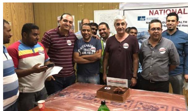
Nesma & Partners - SANG Hospital, Qassim