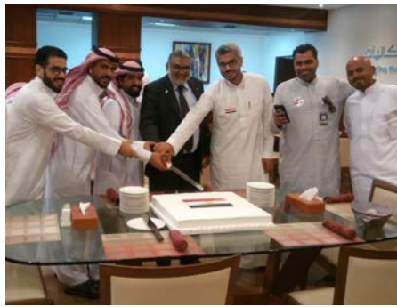
Nesma Holding, Jeddah