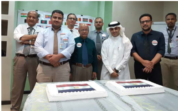
Namma Cargo - Al Khobar

Across Nesma, employees recently celebrated the national day of Egypt