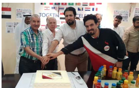
Nesma Telecom & Technology