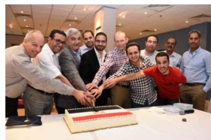
Nesma & Partners - Head Office