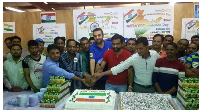
Nesma & Partners - DIRAB Airbase Project