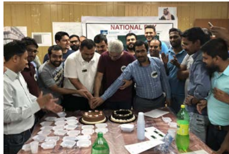
Nesma & Partners - SANG Hospital Project, Qassim