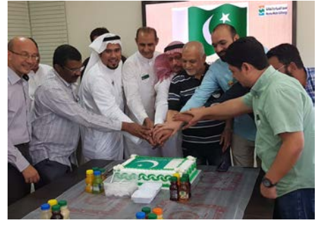
Nesma Water & Energy