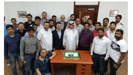
National Port Services