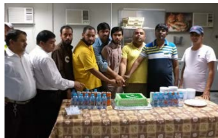
Nesma & Partners - KAUST New Students Housing Project