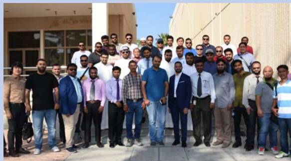
Recently, Nesma's quarterly induction ceremonies were held for new employees.