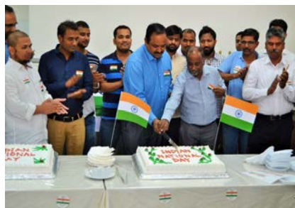
Nesma & Partners - Riyadh Metro Consortium