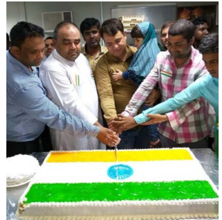
Nesma & Partners - KAUST New Students Housing Project