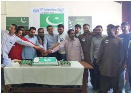
Nesma & Partners - DIRAB Airbase Project