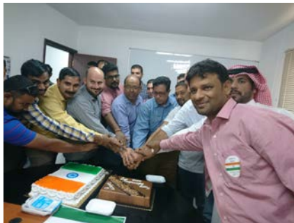
Nesma & Partners - Onshore Maintenance Potential Project and CRP Project