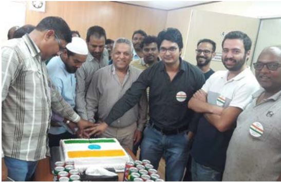
Nesma & Partners - KASC Enhancement Project

Across Nesma, employees recently celebrated the national day of India