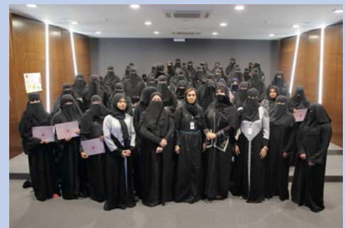
A Soft skills training session was conducted for Nesma Embroidery employees in Thuwal.