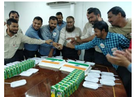
Nesma & Partners - Onshore Maintenance Potential Project