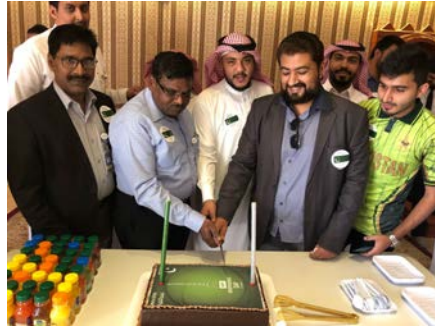
Nesma Airlines, Hail