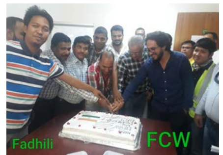
Nesma & Partners - Fadhili Civil Works Project