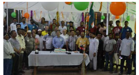
Nesma & Partners - KAFD Project, Riyadh