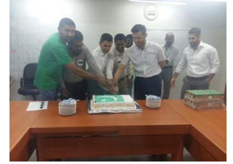
Nesma & Partners - SANG Hospital Program-Level Project, Riyadh