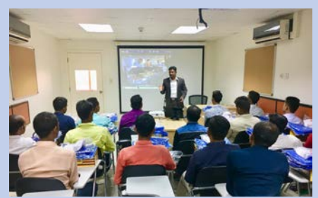
Induction and Personal Grooming training session was conducted for Nesma Catering employees in Khobar.