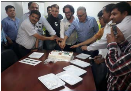
Nesma & Partners - Fadhili Civil Works Project