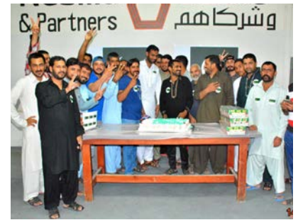
Nesma & Partners - SANG Hospital Project, Riyadh