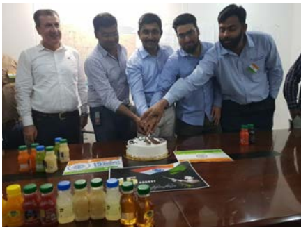
Nesma Trading - Petro Rabigh Security Upgrade Project, Rabigh