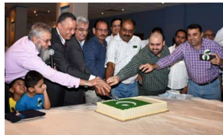
Nesma & Partners Head Office and Nesma Trading, Khobar