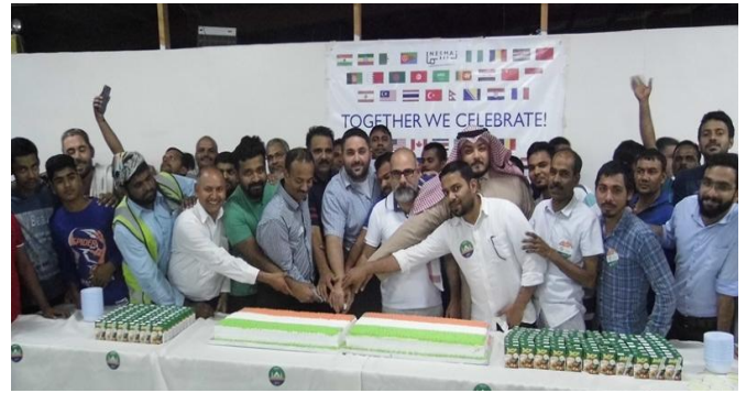
Nesma & Partners - KAAR Project