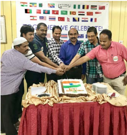
Nesma Trading - Nesma Palms Compound, Jubail