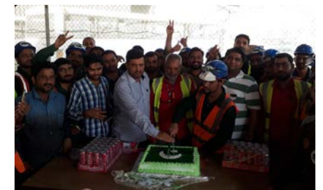
Nesma & Partners - DOW Middle East Innovation Center Project