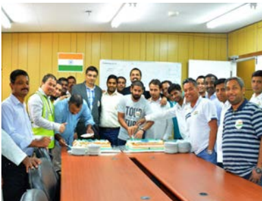
Nesma & Partners - SANG Hospital Project, Riyadh