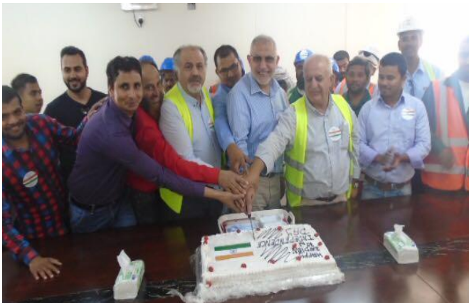
Nesma & Partners - ABC Project