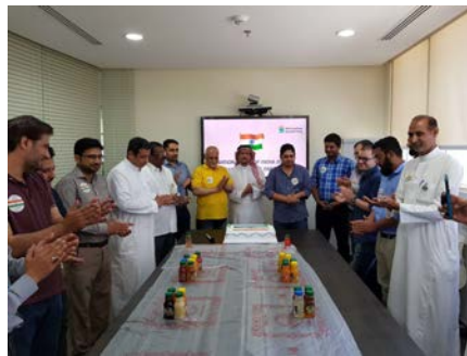
Nesma Water & Energy Head office