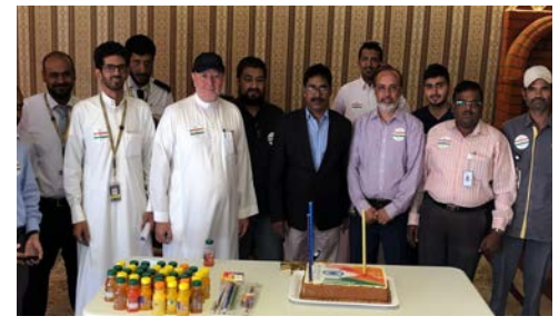
Nesma Airlines, Hail