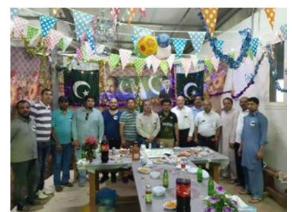
Nesma & Partner - KAFD, Riyadh