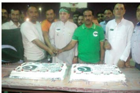
Nesma & Partners - Fadhili Civil Works Project and Fadhili Integrated Building Project