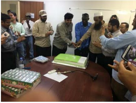
Nesma & partner- Onshore Maintenance Potential and CRP Project