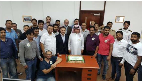
National Port Services