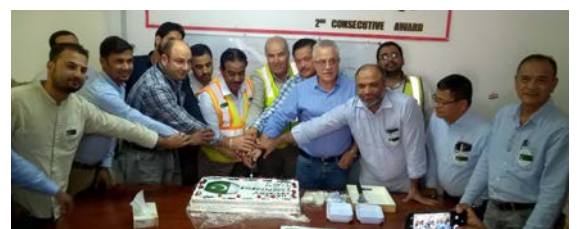
Nesma & Partners - Fadhilli Integrated Building