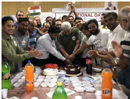
Nesma & Partners - SANG Hospital Project, Qassim