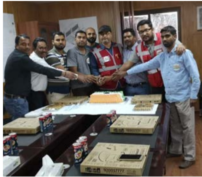
Nesma & Partners - SANG Hospital, Taif