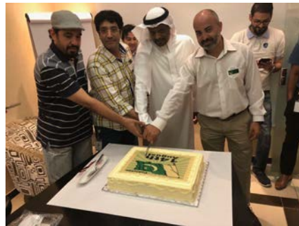
Nesma Telecom & Technology