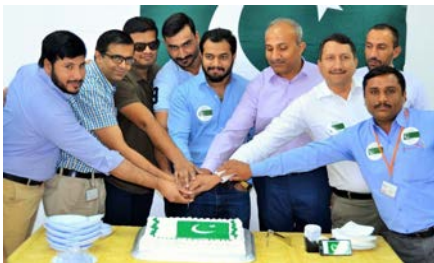
Nesma & Partners - Riyadh Metro Consortium