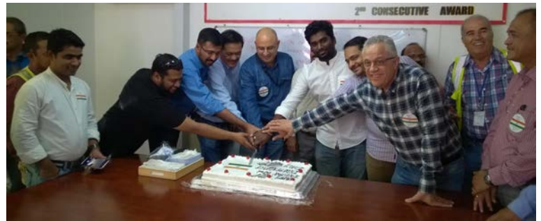
Nesma & Partners - Fadhili Integrated Building Project