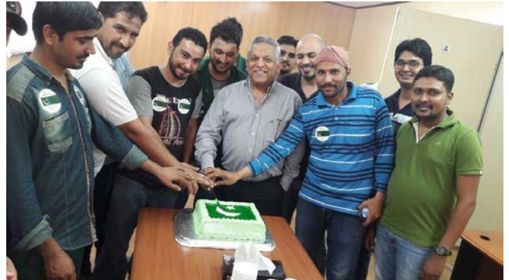
Nesma & Partners - KASC Enhancement Project