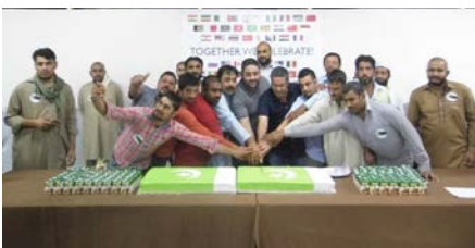
Nesma & Partners - King Abdulaziz Road and Shumaysi Camp Projects