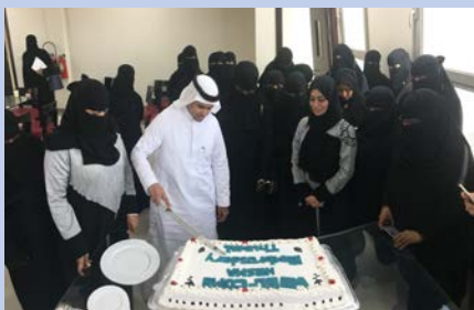
Nesma Embroidery Thuwal celebrating its opening.