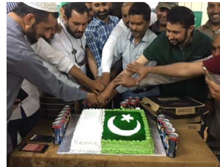
Nesma & Partners - SANG Hospital Project, Taif