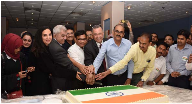
Nesma & Partners Head Office and Nesma Trading, Khobar