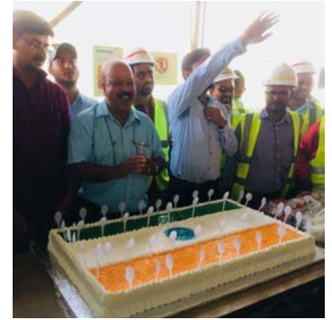
Nesma & Partners - DOW Innovation Center project