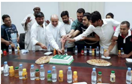
Nesma Water & Energy