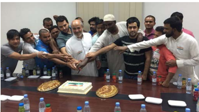
Nesma Water & Energy - Dawadmi Project