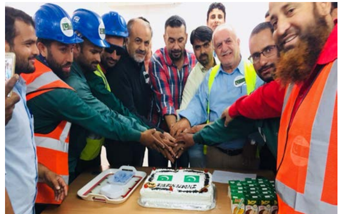
Nesma & Partners - Aramco Bachelor Camp Project