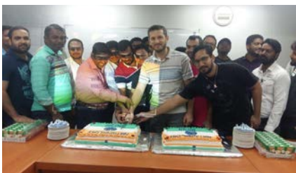
Nesma & Partners - SANG Hospital Program-Level Project, Riyadh