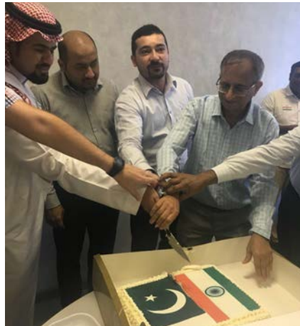
Nesma Telecom & Technology