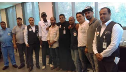
Nesma Training Center