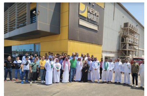
Nesma Orbit, Jeddah