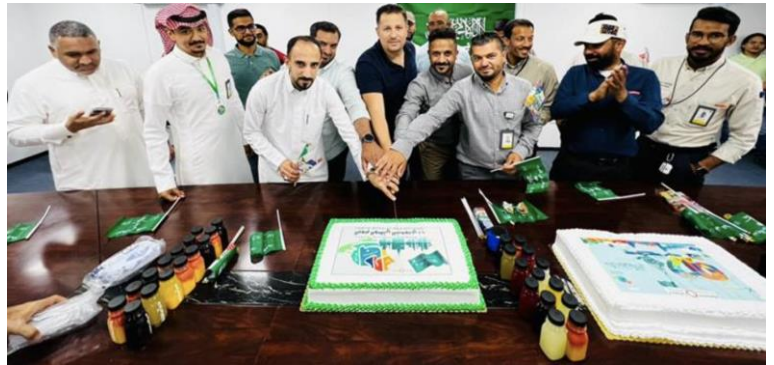
Nesma & Partners, Awis project