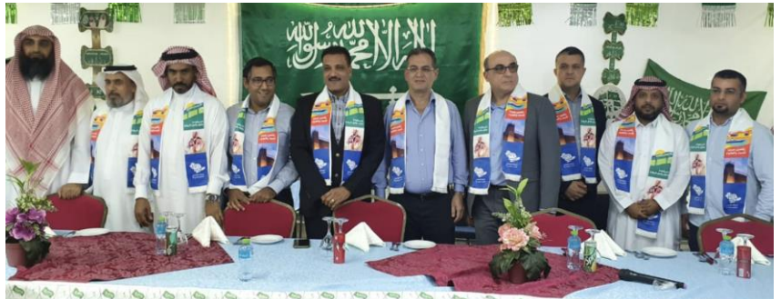
Nesma & Partners, Shumaisy Camp, MASAR project