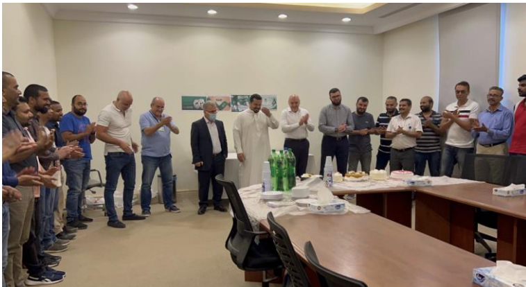
Nesma & Partners, NASJV - KFAA MAJMAA project TSO