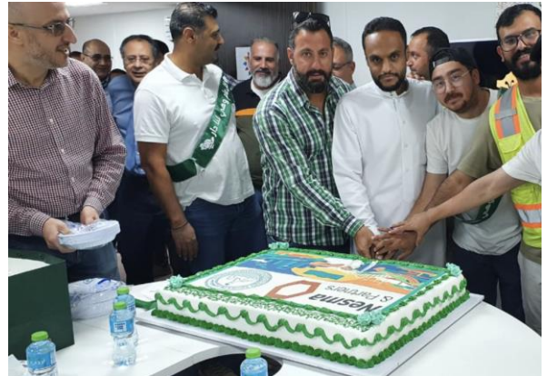
Nesma & Partners, Western Ring Road project