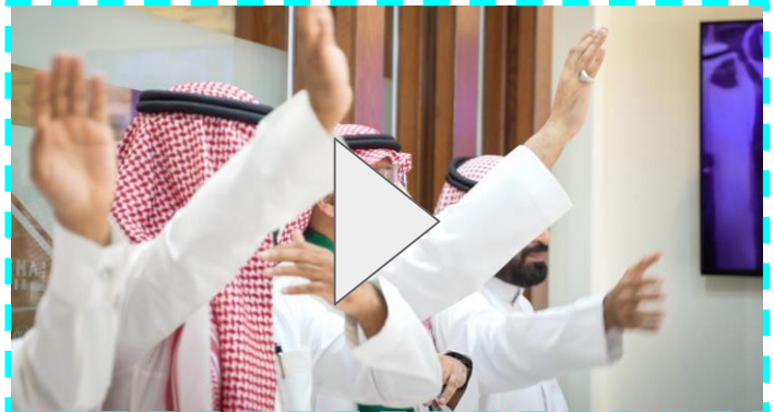
Nesma United Industries. Head office, Al Khobar