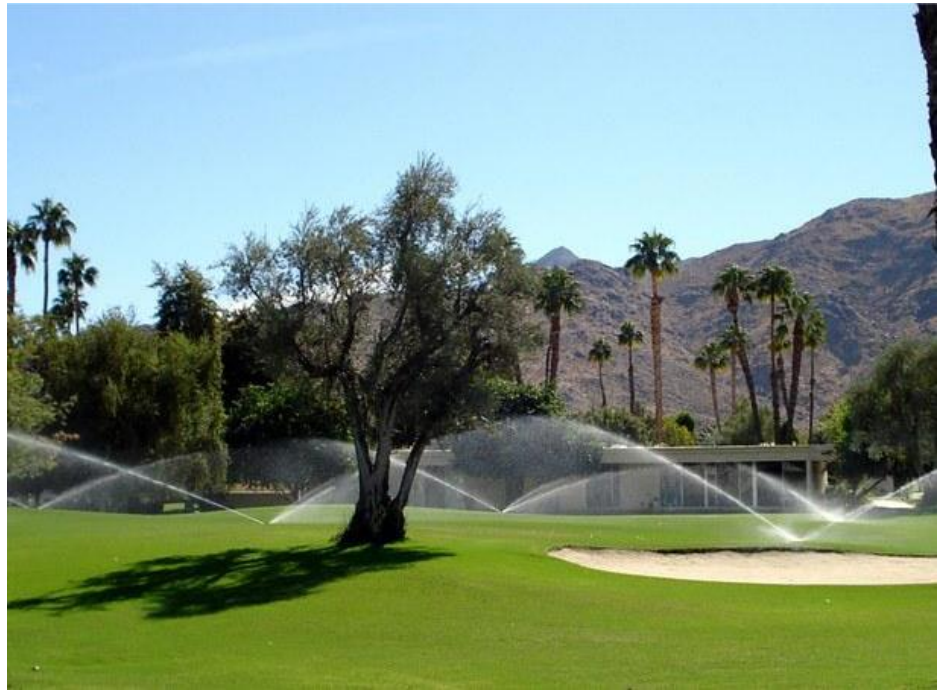
Representation only - actual photos will appear in a future Insider issue.

Construction on the 18-hole course began in May 2021 and was completed in record time despite major challenges such as a 100-day weather delay. NUI's scope of work has included all infrastructure, earthworks, irrigation, planting, finishes and more. The final product has been hailed as setting a new benchmark for golf course design and aesthetic.