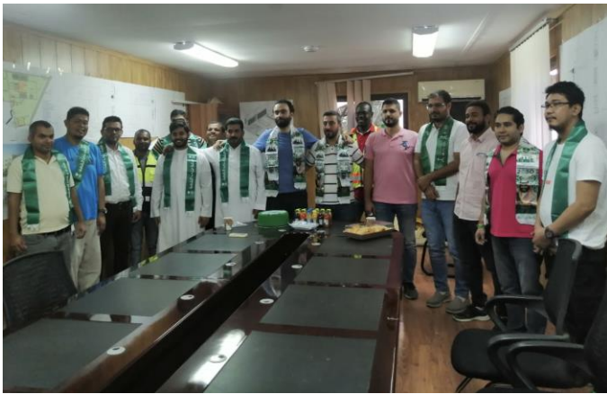
Nesma & Partners, SANG Hospital Taif project