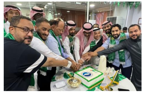
Namma Shipping, Jeddah