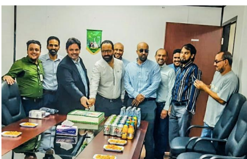
Nesma United Industries, Dhahran FA/FF O&M Project & Aramco