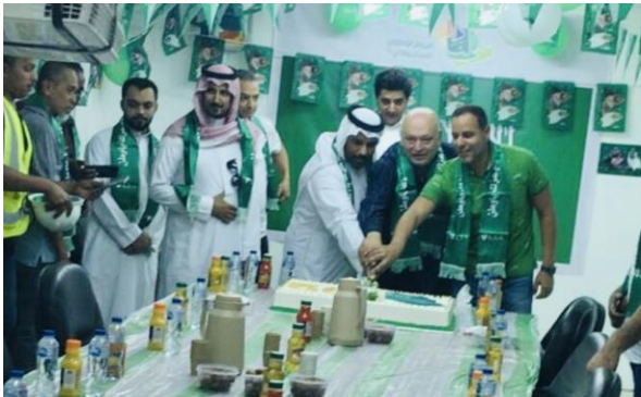
Nesma & Partners, Sang Qassim project