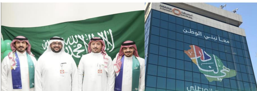
Nesma & Partners, Head office, Al Khobar