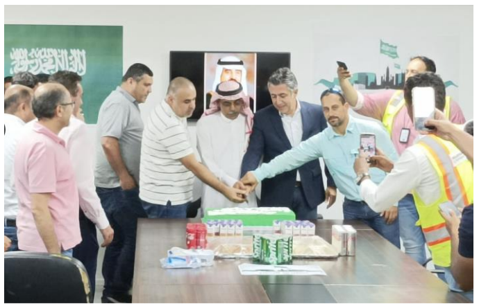
Nesma & Partners, NEOM projects Sharma, Tabuk