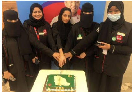
Jollibee and Chowking , Jeddah