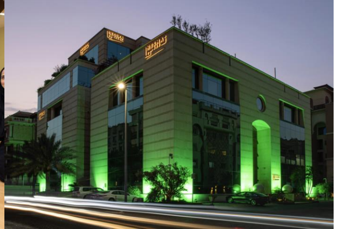
Nesma Co. HQ, Jeddah