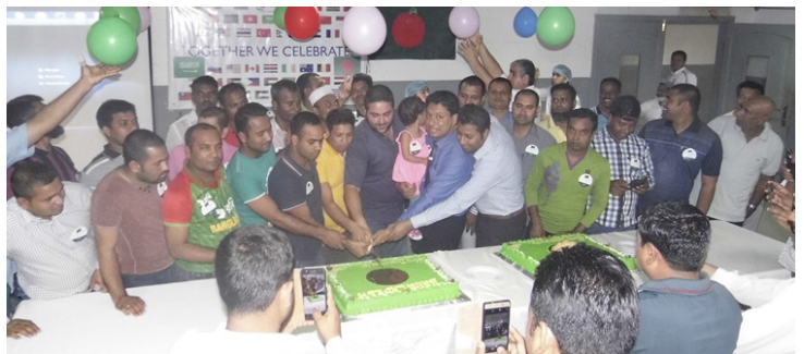
Nesma & Partners and Nesma Trading