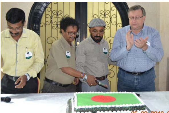
Nesma Telecom & Technology