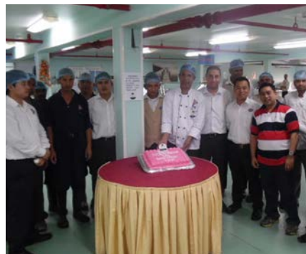
Jazan Aramco Catering