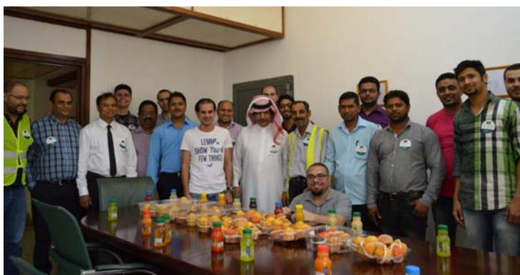
National Port Services