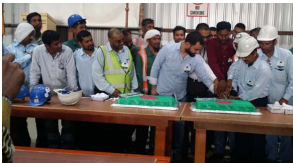
Nesma & Partners - SADARA SPC