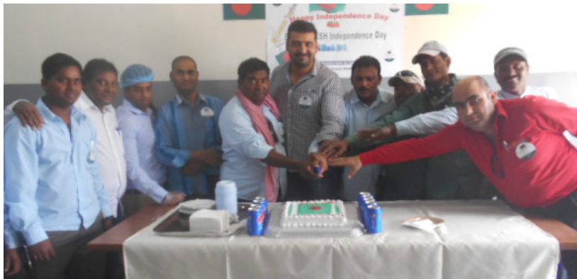
Nesma & Partners - Dirab Airbase