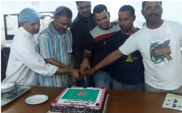
Nesma & Partners - Jubail Bulk Plant