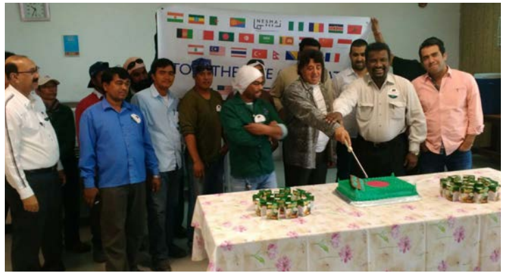
Nesma & Partners - SANG Hospital Riyadh