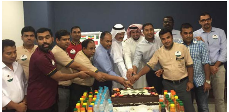
Nesma & Partners - SANG Hospital Jeddah