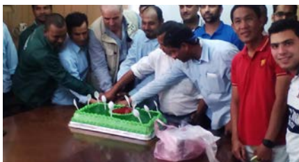
KAUST Revovation Project