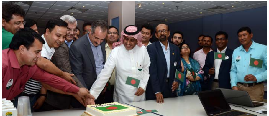
Nesma & Partners - Al Khobar