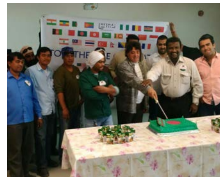
Nesma & Partners - Jubail Camp