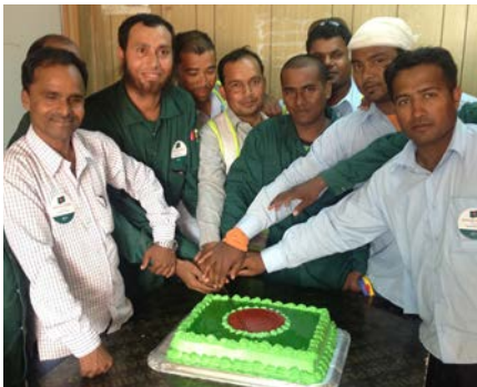
Kaust Innovation Center Project