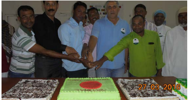
Nesma & Partners - SANG Hospital Jeddah