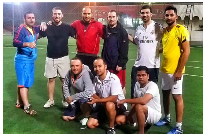
NESMA/SADARA-SPC football team preparing for Jubail football tournament