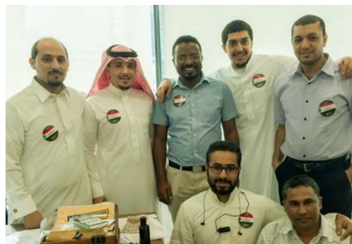
Nesma & Partners