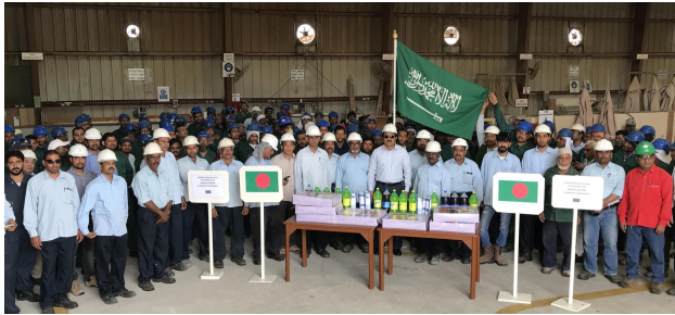
Nesma & Partners - Fab Shop, Dhahran.

Across Nesma, employees recently celebrated the national day of Bangladesh