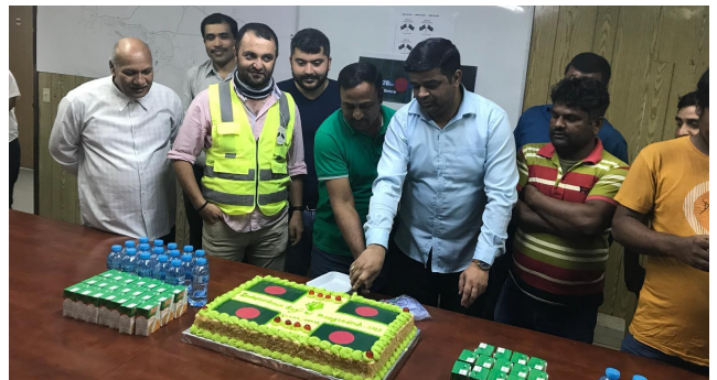
Nesma & Partners - Neom Camp Northern Project and External Works.