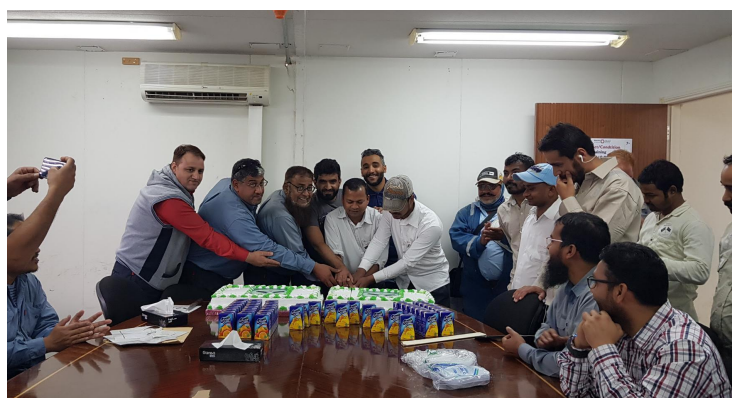
Nesma & Partners - OMPP Project.