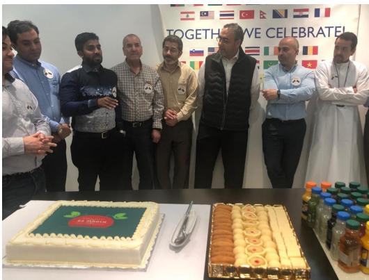
Nesma Telecom & Technology.