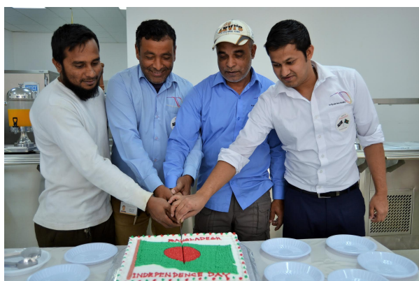
Riyadh Metro Consortium.