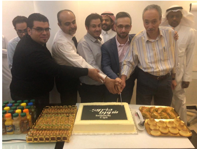
Nesma Telecom & Technology

Across Nesma, employees recently celebrated the national day of Syria