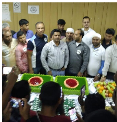
Nesma & Partners- SANG Hospital Project, Taif.