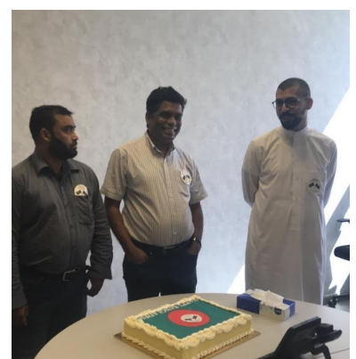
Nesma Telecom & Technology, Jeddah.