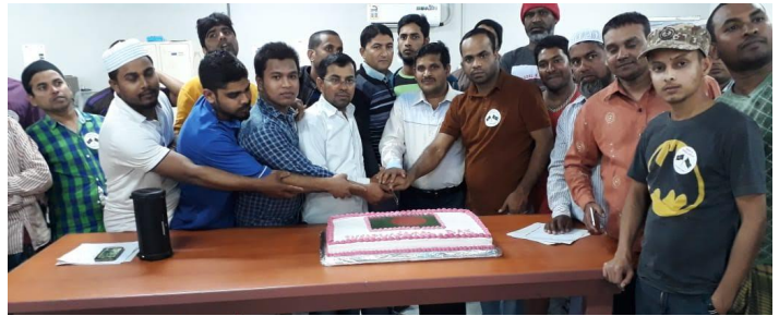
Nesma & Partners - Fadhili Civil Works Project and Fadhili Integrated Building.