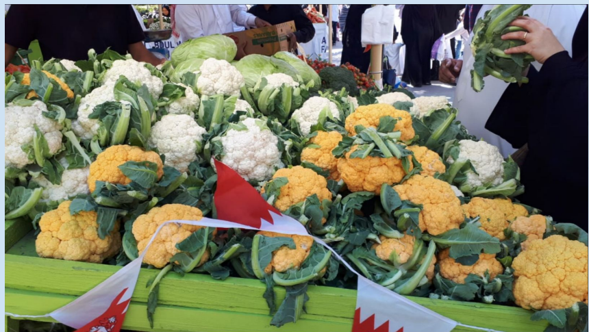
Photo of the weekly farmers fair in Bahrain.