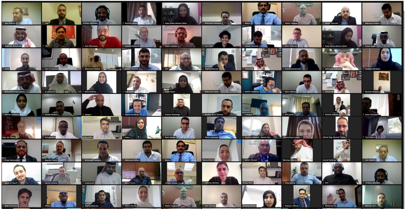
Nesma Data Strategies Workshop October 4-5, 2020

Nesma Holding has launched the “Nesma Virtual Leadership Program,” containing a series of online workshops for Nesma employees across the group.