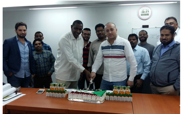
Nesma & Partners - SANG PMO, Riyadh