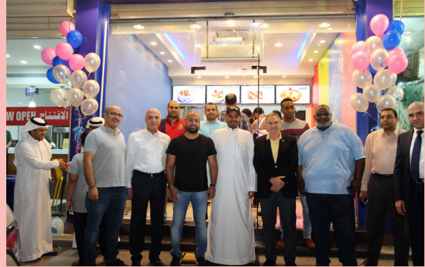
Opening of Alban El-Malky's new branch in Jeddah, Al-Naseem District, Ali Almortada Street.