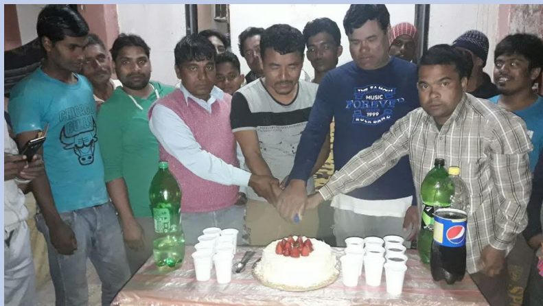
Nesma & Partners - SANG Hospital Project, Taif

Across Nesma, employees recently celebrated the national day of Nepal.