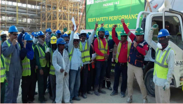
Nesma & Partners' FCW HSE department's latest award for the "Best HSE Performance Award" from Fadhili project management.