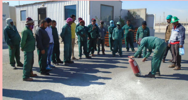
Fire extinguisher safety drill held by Nesma & Partners' scaffolding services team.