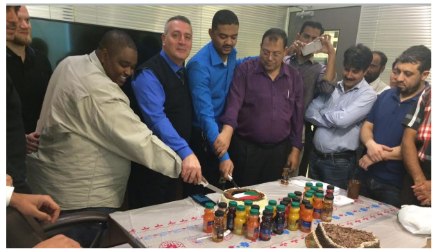
Nesma Telecom & Technology, Jeddah

Across Nesma, employees recently celebrated the national day of Nepal.