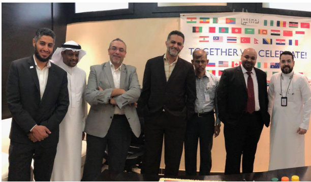
Nesma Telecom & Technology, Riyadh