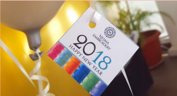
Nesma Embroidery celebrating the new year.