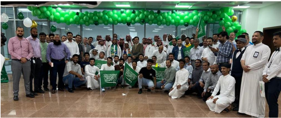
Modern Bus Company, Makkah