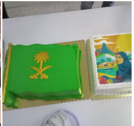
Nesma & Partners, KSAB, Riyadh