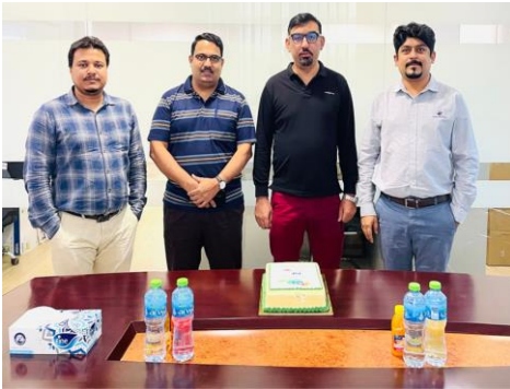
Nesma Infrastructure & Technology, Kingdom of Bahrain