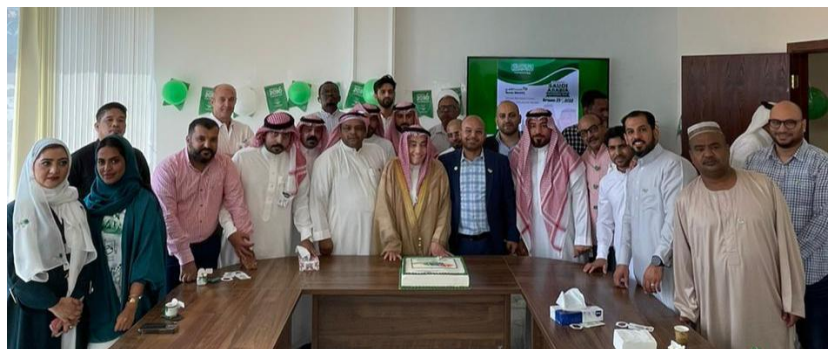
Nesma Security, Khobar