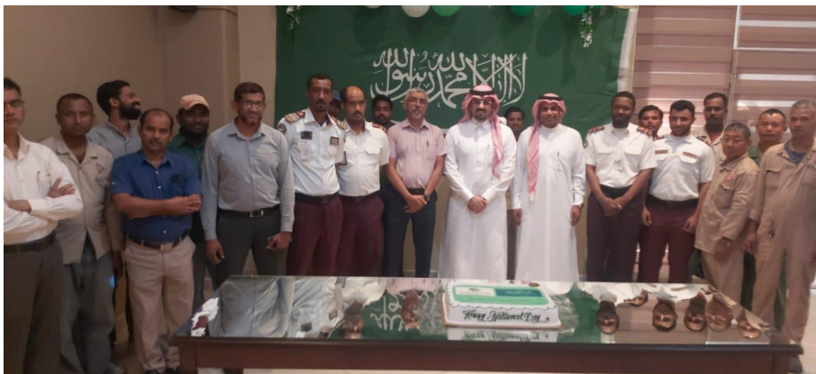
Nesma Real Estate, Khobar