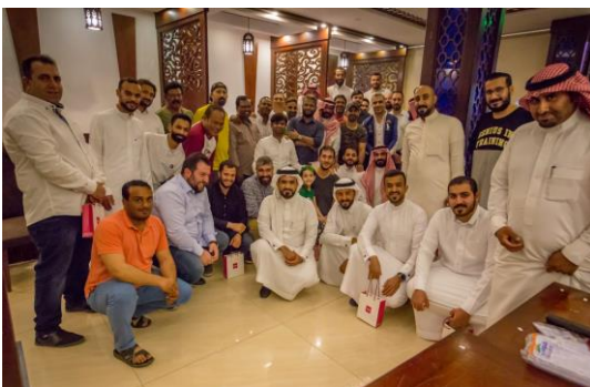
Nesma & Partners, HUGRS & OMPP SA4