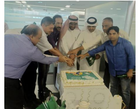
Nesma Water & Energy, Jeddah