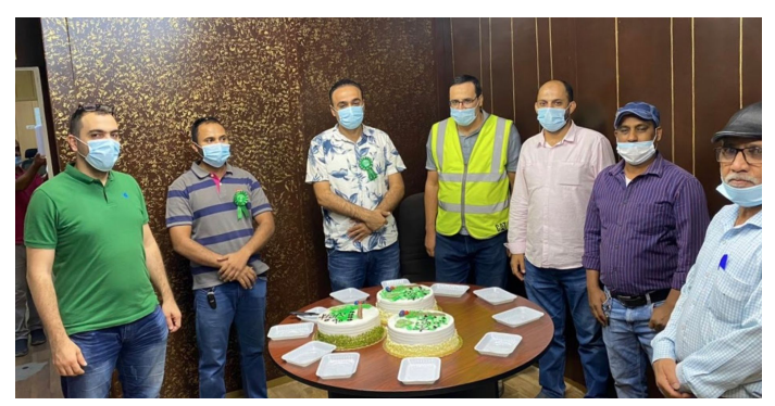
Nesma Trading - Mawaddah Project