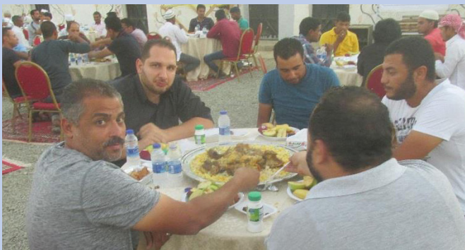
Nesma Water & Energy, Hejaz Project