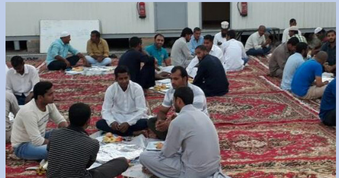
Nesma Water & Energy, Water Meter Project, Jeddah