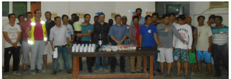
Nesma & Partners, KAFD Project, Riyadh