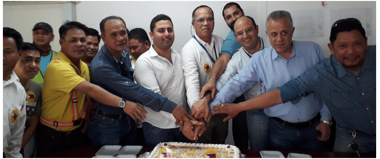
Nesma & Partners, FIB & FCW