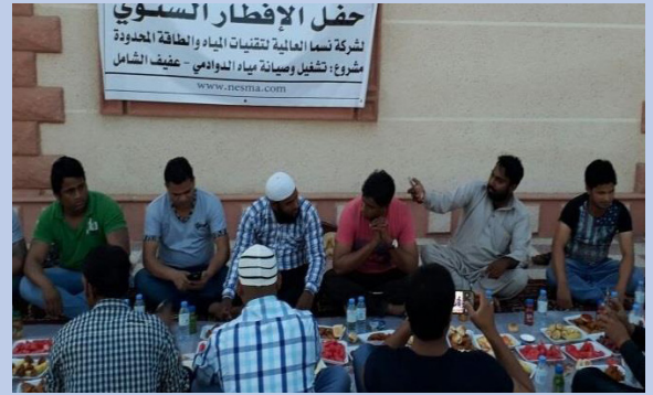
Nesma Water & Energy, Dawadmai & Affif Project