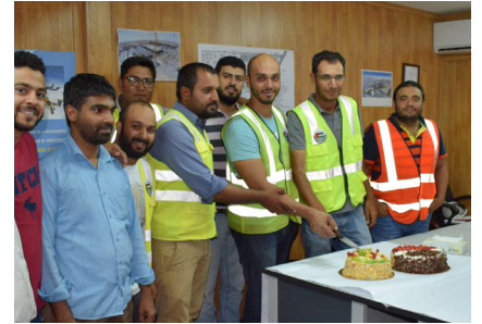
Nesma & Partners, SANG Hospital, Taif

Across Nesma, employees recently celebrated Iftar together.