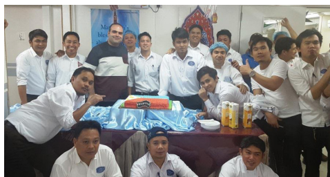
Nesma Catering, Wasit Aramco Project