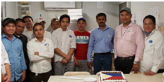
Nesma Catering, Schlumbergers Project