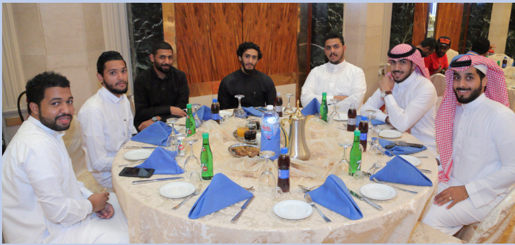
Nesma Holding, Jeddah

Across Nesma, employees recently celebrated Iftar together.