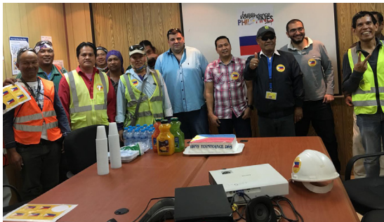
Nesma & Partners, Umm Wual Project