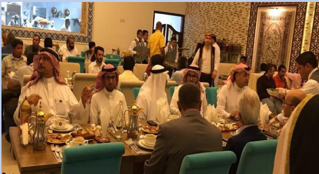
Nesma Water & Energy, Modon Project, Jeddah