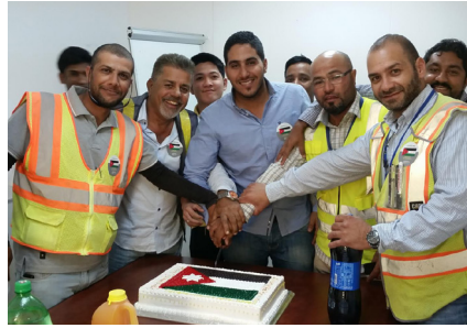
Nesma & Partners, Fadhili Project