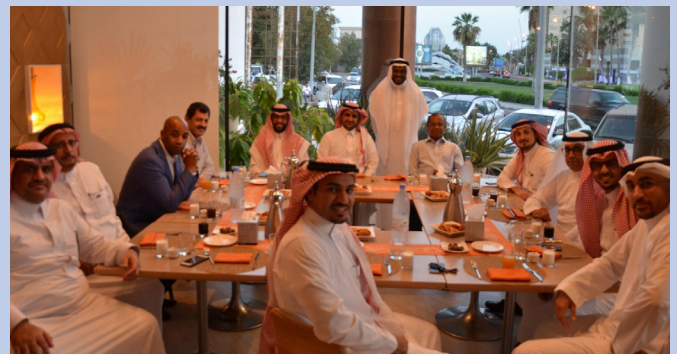
Nesma Water & Energy, Jeddah