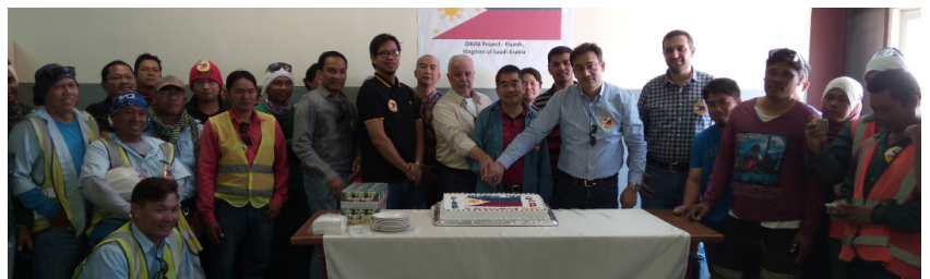
Nesma & Partners, DIRAB Airbase Project