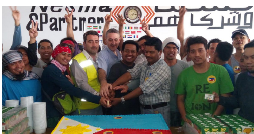
Nesma & Partners, SANG Hospital, Jeddah

Nesma Recycling employees recently celebrated the national day of Yemen.