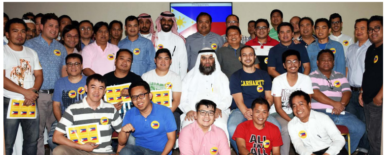
Nesma & Partners, Head office, Al Khobar