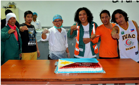
Nesma & Partners, SANG Hospital, Riyadh

Across Nesma, employees recently celebrated the national day of Philippines.