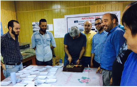
Nesma & Partners, SANG Hospital, Qassim

Across Nesma, employees recently celebrated the national day of Jordan.