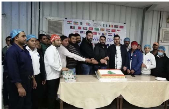
Nesma & Partners - Nammar Valley camp, Riyadh

Across Nesma, employees celebrated the national day of Lebanon.