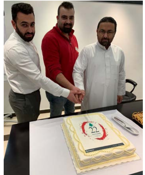
Nesma Telecom & Technology