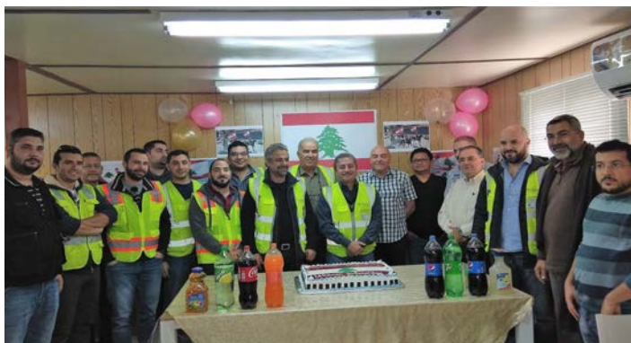
Nesma & Partners - KAFD Project, Riyadh