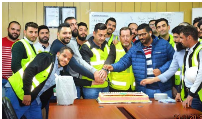
Nesma & Partners - SANG Hospital Project, Riyadh