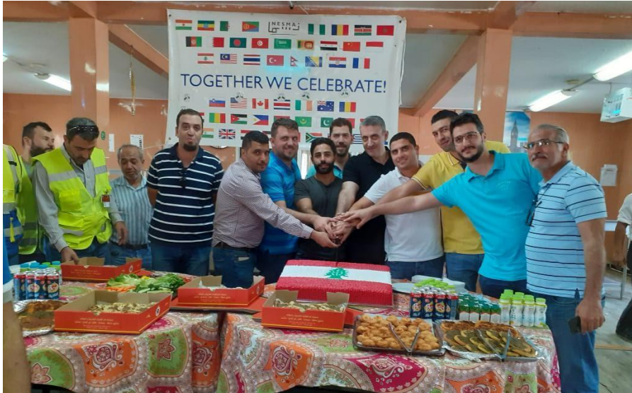
Nesma & Partners - SANG Hospital Project - Jeddah

Across Nesma, employees celebrated the national day of Lebanon.