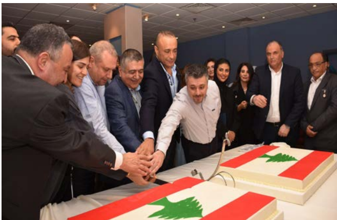
Nesma & Partners Head Office