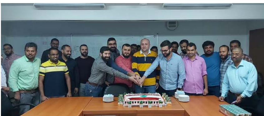
Nesma & Partners - FIB and FCW Projects