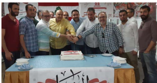
Nesma & Partners - SANG PMO, Riyadh