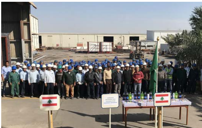
Nesma & Partners - Fab Shop Project, Dhahran