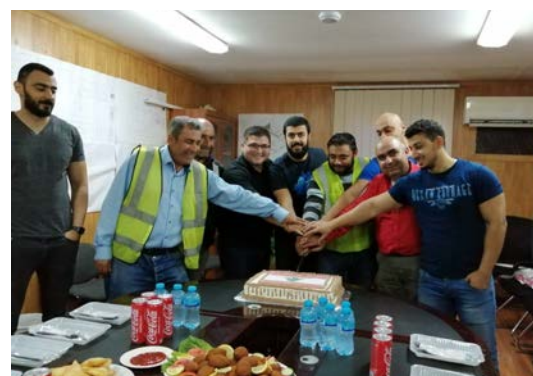
Nesma & Partners - KAAR Project