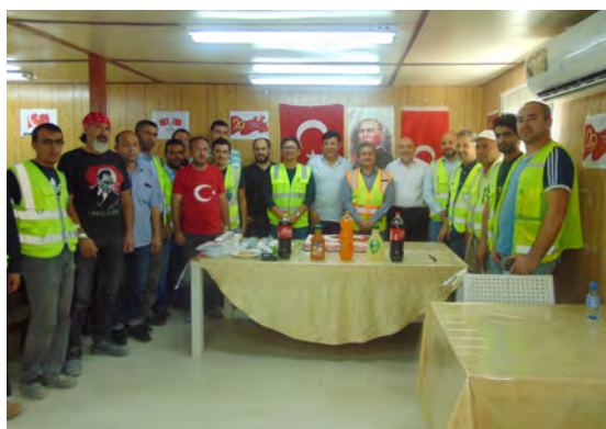
Nesma & Partners - KAHD, Riyadh