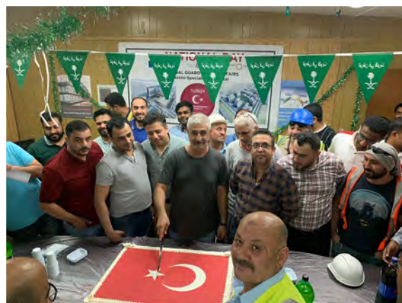
Nesma & Partners - SANG Hospital Project, Qassim