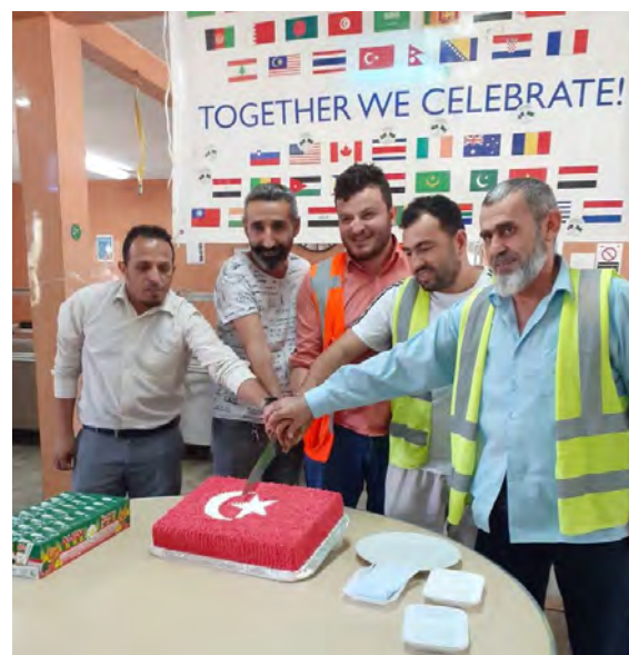
Nesma & Partners - SANG Hospital Project, Jeddah