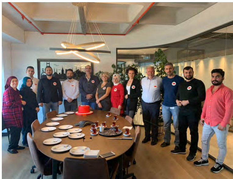
Nesma & Istanbul line

Across Nesma, employees celebrated the national day of Turkey .