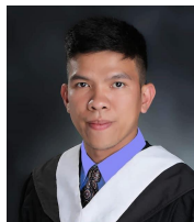
International University of Isabel 1, Barcelona, Spain.