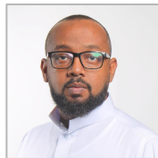
from Swedish - Ukrainian Beetroot Academy earning a Front-End Development certificate.