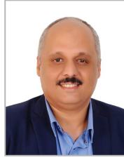
Certificate, from the American Project Management Institute.