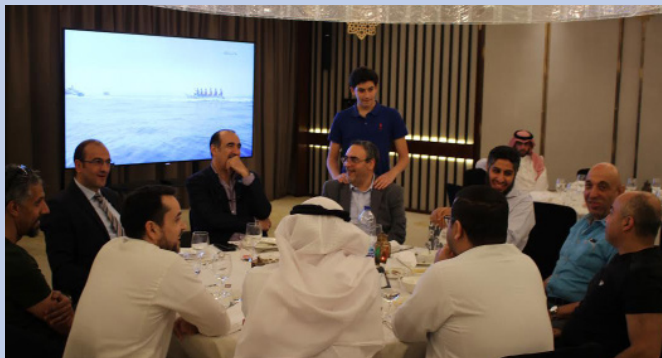
Nesma Telecom & Technology