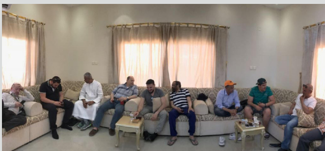
Nesma Airlines employees enjoyed a social day organized by the company's HR team.