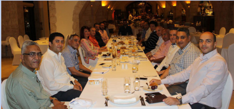
Nesma and Namma Shipping lines, Egypt

Across Nesma, employees recently celebrated Iftar together.