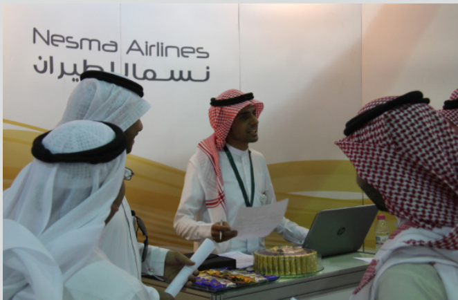
Nesma Airlines participated at an employment exhibition at Al-Jouf University.