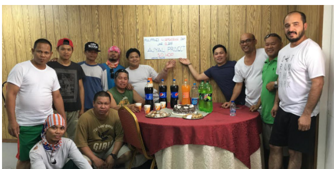
Nesma & Partners - Ajjal Project