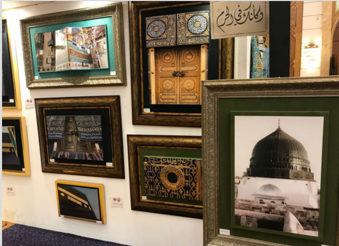
Photos from latest photography exhibition by Arwa Mohsen, Senior Accountant, Nesma Embroidery.