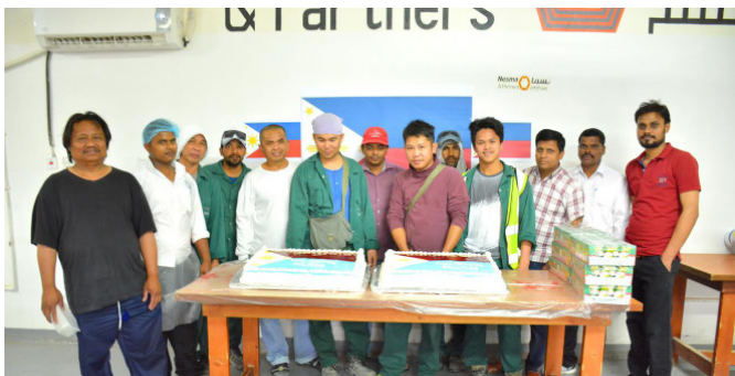
Nesma & Partners - SANG Hospital Riyadh Project