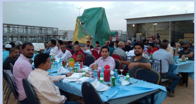
Nesma & Partners - SANG Hospital Project, Taif