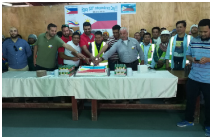
Nesma & Partners - DIRAB Airbase Project