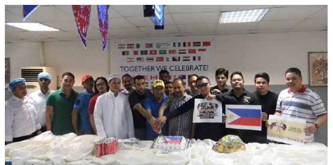
Nesma & Partners - King Abdulaziz Road Project