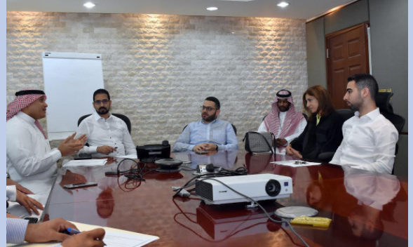
Nesma & Partners - Committee Iftar