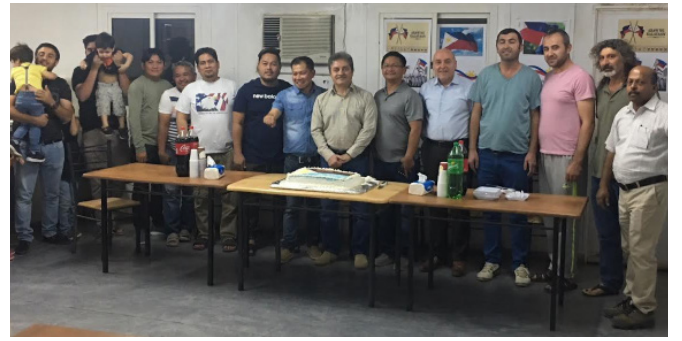
Nesma & Partners - King Abdullah Financial District Project