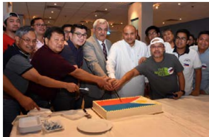
Nesma & Partners Head office