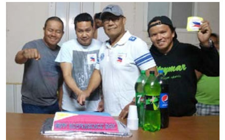
Nesma & Partners - Umm Wu'al Fluosilicic Acid Treatment Facility Project