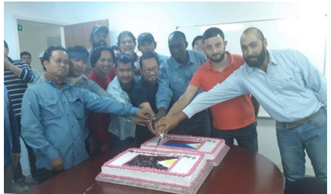
Nesma & Partners - Onshore Maintain Potential Project