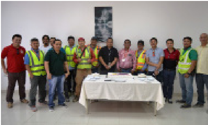
Nesma & Partners - Riyadh Metro Consortium

Across Nesma, employees recently celebrated the Independence Day of Philippines