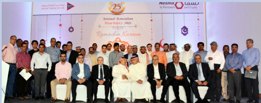
Nesma & Partners, Khobar