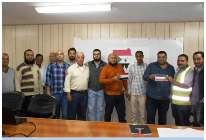
Nesma & Partners - Dirab Airbase