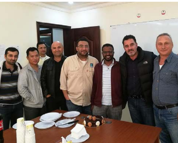
Nesma & Partners - Ras Tanura Project