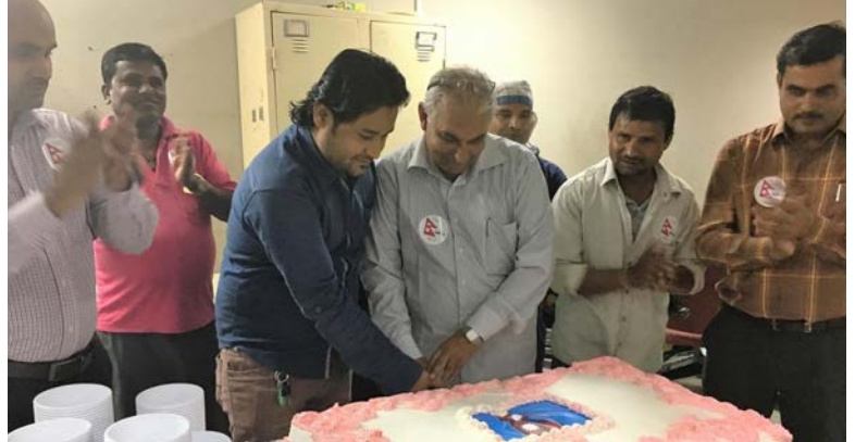
Nesma & Partners - Thuwal Main Camp & KAUST New Student Housing

Employees recently celebrated the national day of Sudan.