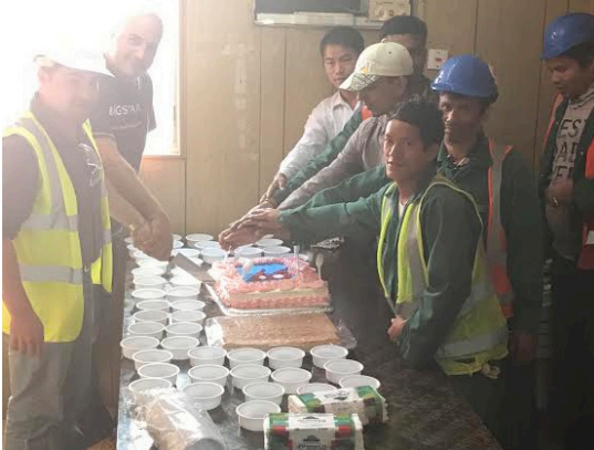
Nesma & Partners - KAUST Innovation Center

Across Nesma, employees recently celebrated the national day of Nepal.