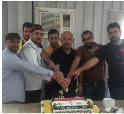
Nammar Valley Metro