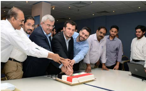
Nesma & Partners - Head Office