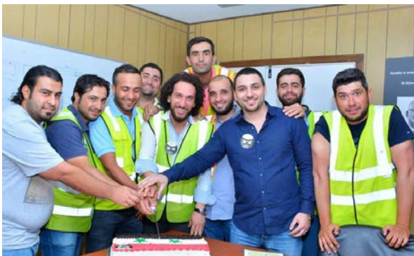
SANG Hospital - Riyadh