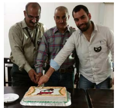
Nesma & Partners - SADARA SPC