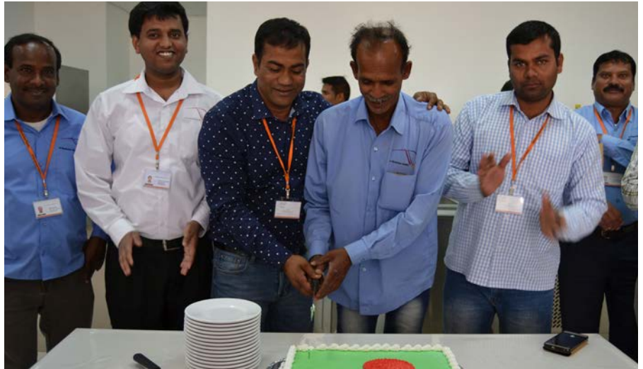
Nesma & Partners - RMC