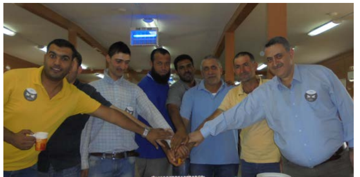
SANG Hospital - Jeddah