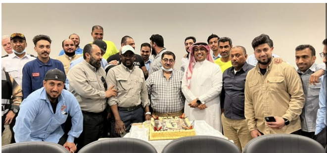
Nesma United Industries' Ramadan celebration