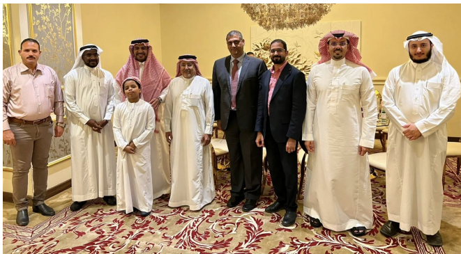
Nesma Water & Energy shares annual Iftar meal.