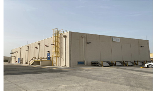
NEW CONSTRUCTED PROCESS INTERFACE BUILDING (PIB) - G26:

Projects such as these help the Kingdom maintain a reliable and cost-effective production of crude oil.