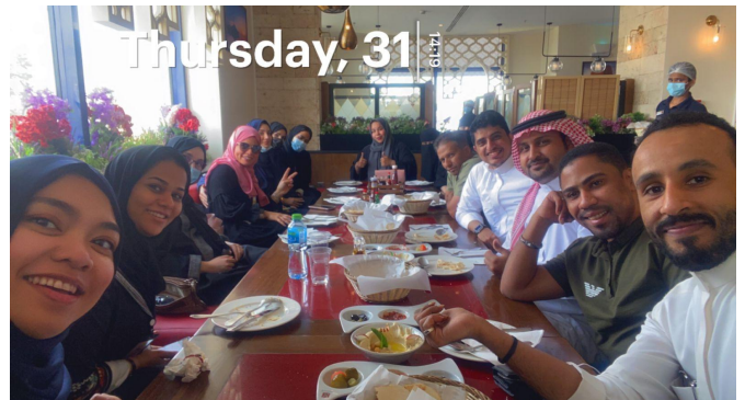
Modern Bus Co. Ramadan celebration