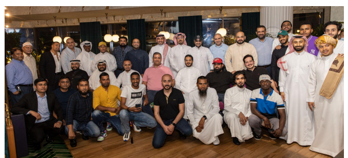
Nesma Co. Ramadan Suhoor