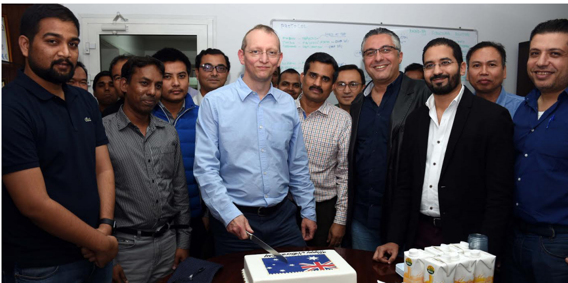
Nesma & Partners - Head Office

Nesma & Partners recently celebrated the national day of Australia