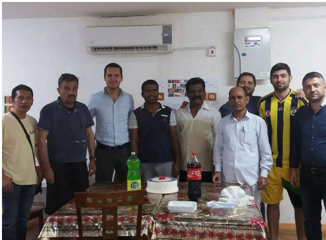
Nesma & Partners - Baysh Road Upgrade & New Roads Project