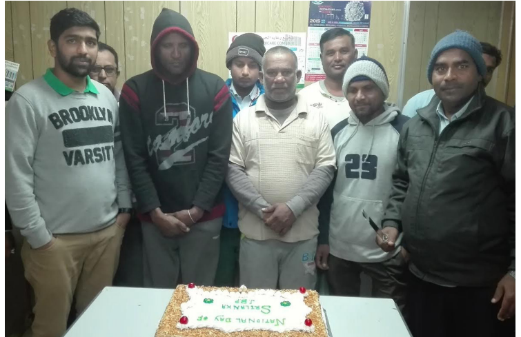
Nesma & Partners -JBP Project