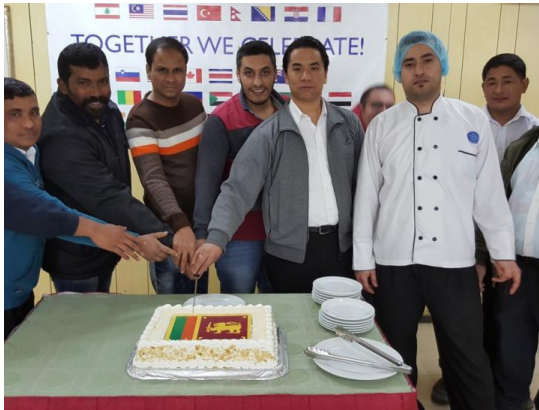
Nesma Palms Compound Jubail

Across Nesma, employees recently celebrated the national day of Sri Lanka.