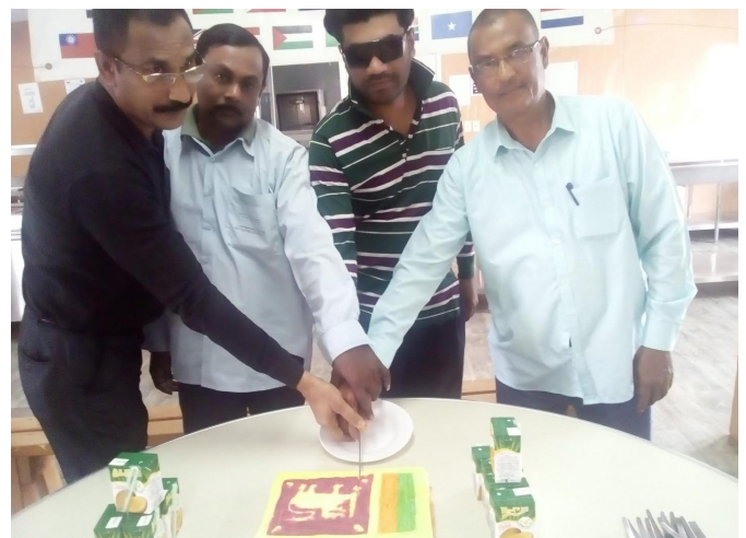
Nesma & Partners - SANG Hospital Jeddah