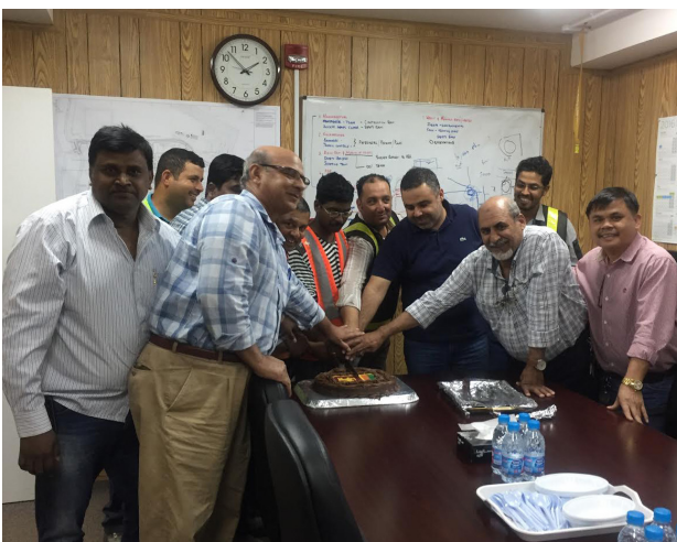
Nesma & Partners - KNHP Project