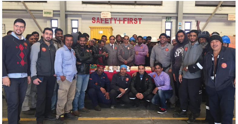
National Port Services