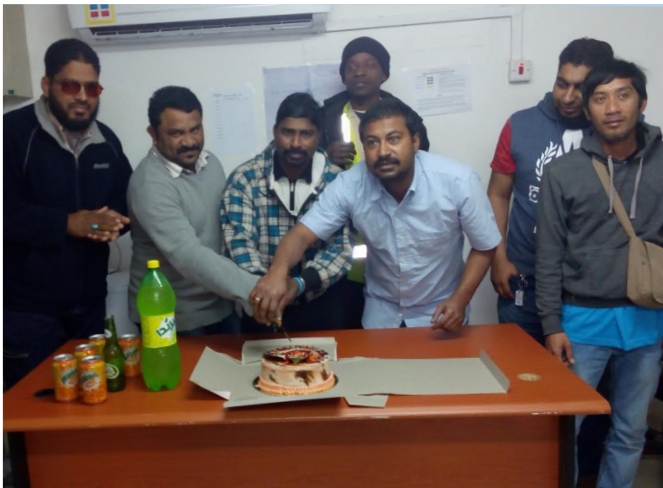
Nesma & Partners -RTR Project Roads Project