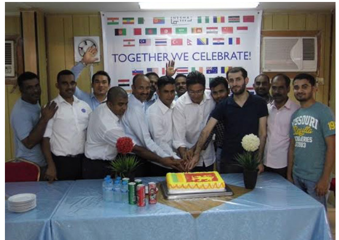
Nesma & Partners - JODP Project