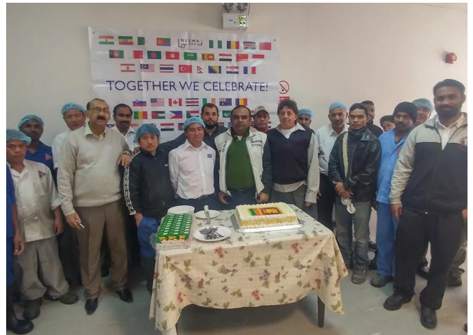
Nesma Catering Jubail Camp 1

Nesma & Partners recently celebrated the national day of Australia