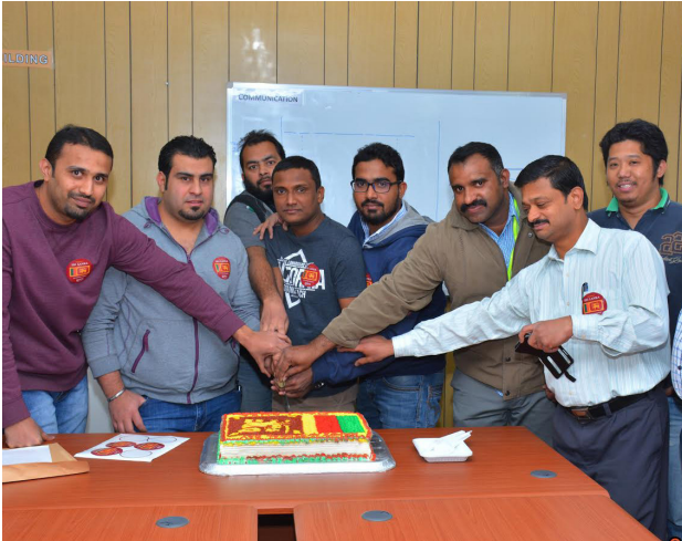
Nesma & Partners - SANG Hospital Riyadh