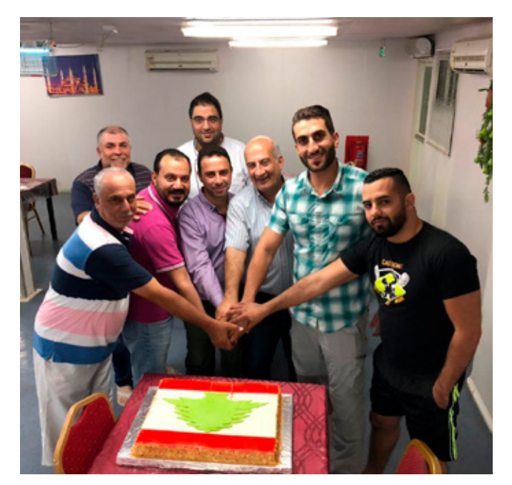
Nesma Trading - Jizan Refinery and Marine Terminal Project

Across Nesma, employees recently celebrated the national day of Lebanon