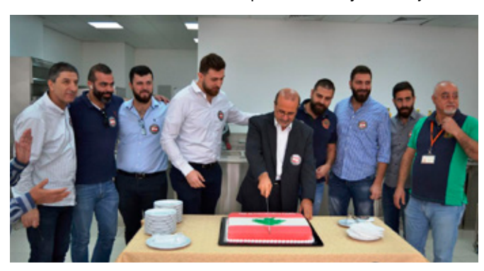
Nesma & Partners - ArRiyadh New Mobility