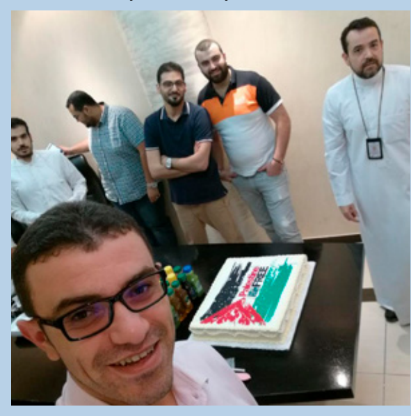
Nesma Telecom & Technology, Riyadh