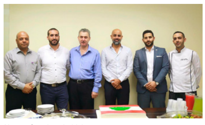
Nesma Catering, Jeddah