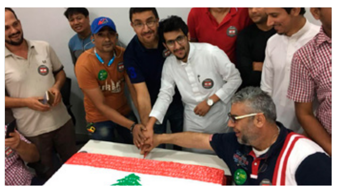
Nesma Orbit, Jeddah