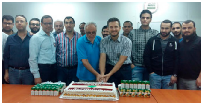
Nesma & Partners - SANG Hospital-PMO Riyadh Project