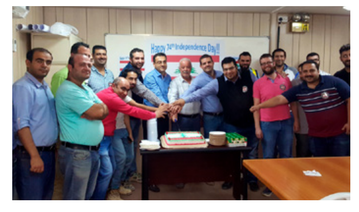
Nesma & Partners - DIRAB Project