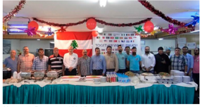
Nesma & Partners - KAAR Project