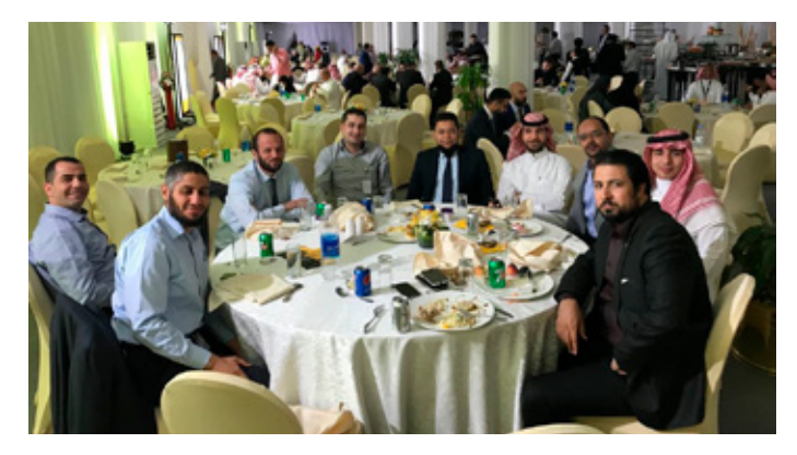
Nesma's participants in Asbar World Forum 2017