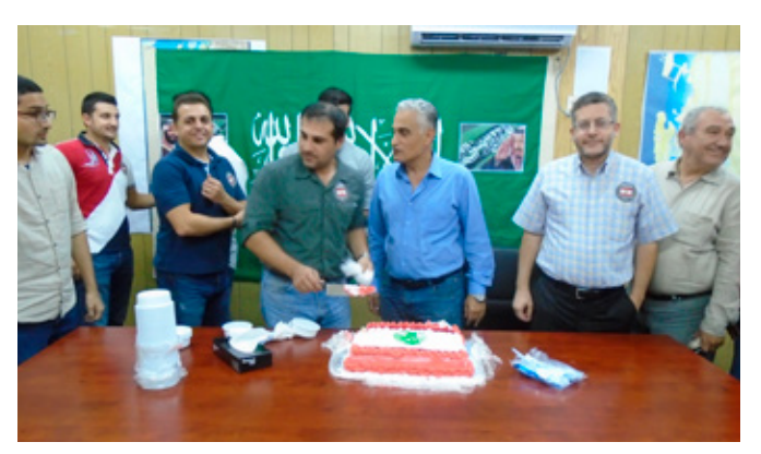
Nesma & Partners - KAUST Innovation Center