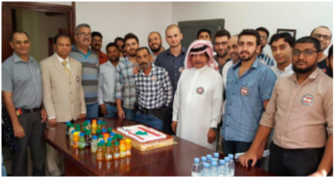
National Port Services - Jubail