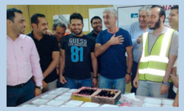
Nesma & Partners - KASH Qassim Project