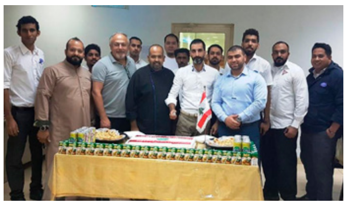
Nesma Catering - Main Camp