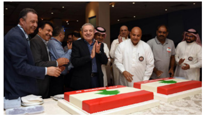
Nesma & Partners - Head Office, Alkhobar