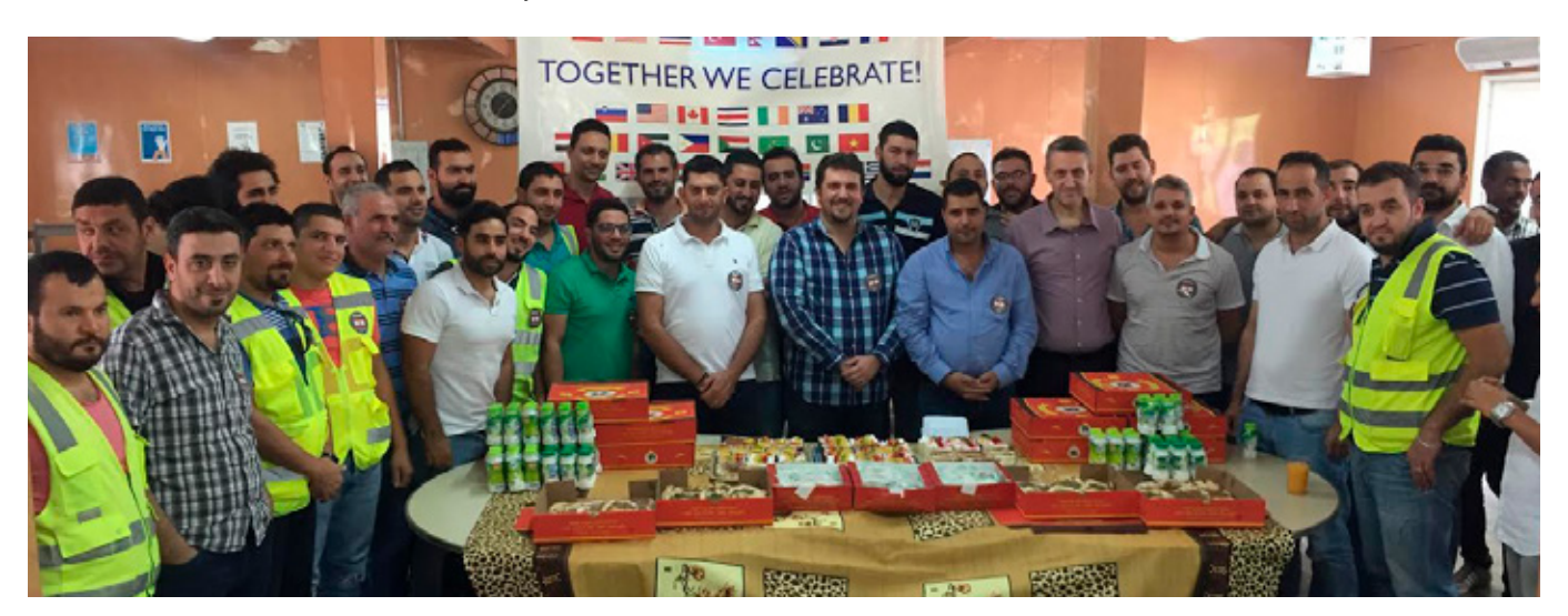
Nesma & Partners - SANG Hospital, Jeddah