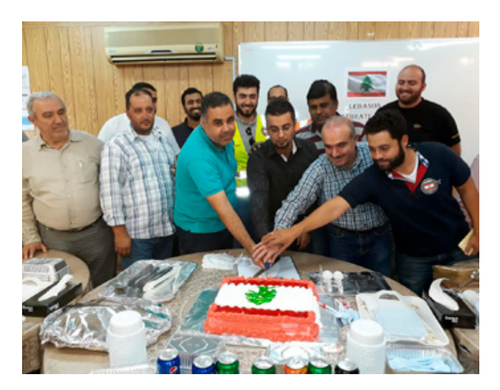
Nesma & Partners - KNHP, Thuwal