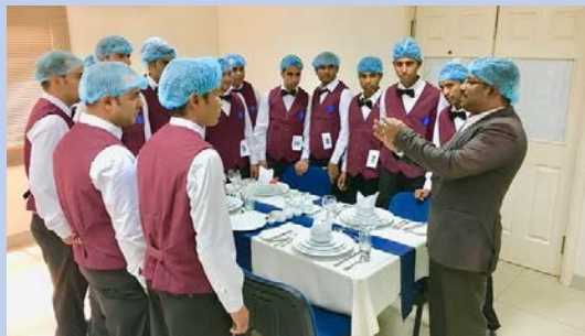
A Restaurant Service training session was conducted for Nesma Catering new employees in Khobar.