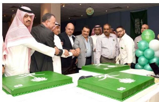
Nesma & Partners Head Office and Nesma Trading