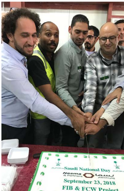
Nesma & Partner FIB & FCW project