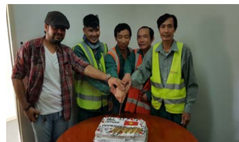
Nesma & Partners - Fadhili Civil Works Project and Fadhili Integrated Building Project