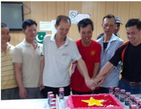
Nesma & Partners - SANG Hospital, Taif

Across Nesma, employees recently celebrated the independence day of Vietnam