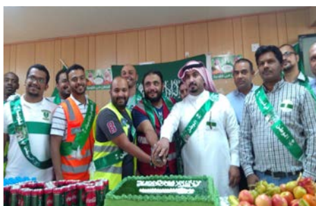
Nesma & Partners - SANG Hospital, Taif