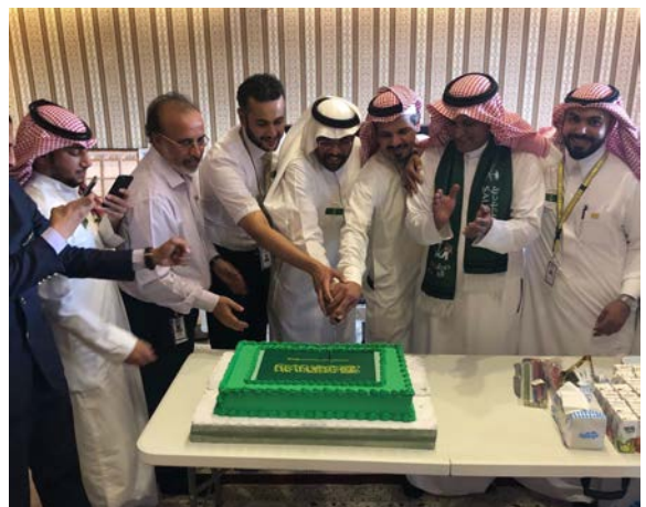
Nesma Airlines, Hail