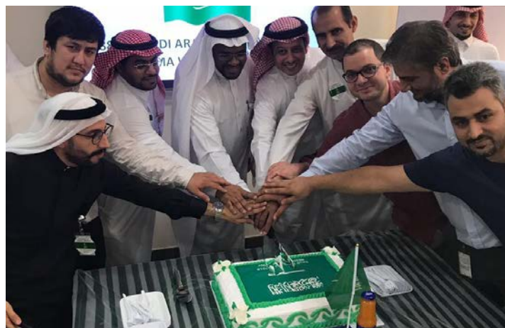
Nesma Water & Energy