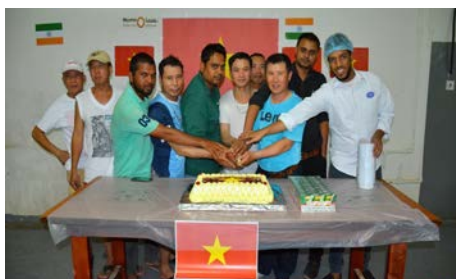
Nesma & Partners - SANG Hospital, Riyadh