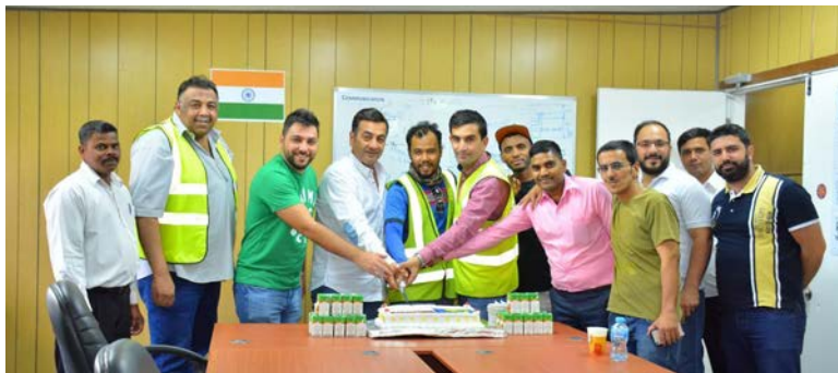
Nesma & Partners - SANG Hospital, Riyadh

Across Nesma, employees recently celebrated the independence day of Malaysia