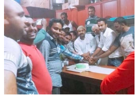
Nesma & Partners - Ras Tanura Project

Across Nesma, employees recently celebrated the independence day of Pakistan