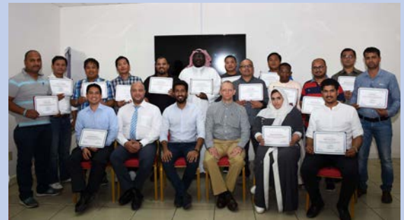
16 employees from Nesma & Partners attended an ISO 45001 SMS Internal Auditors training course.