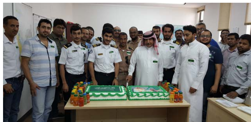
National Port Services