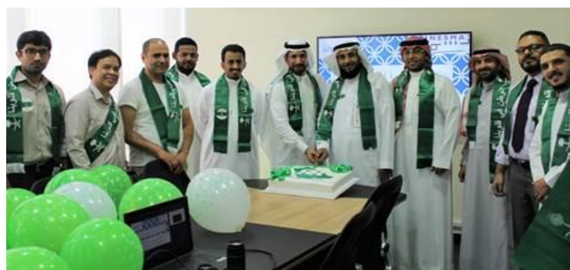
Defaf United Logistic