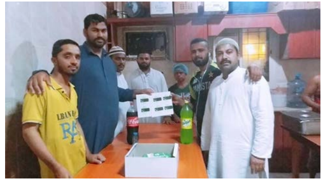
Nesma & Partners - Ras Tanura Project

Across Nesma, employees recently celebrated the independence day of Vietnam