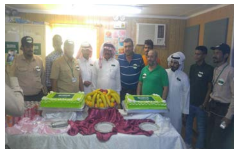
Nesma & Partners - North Project