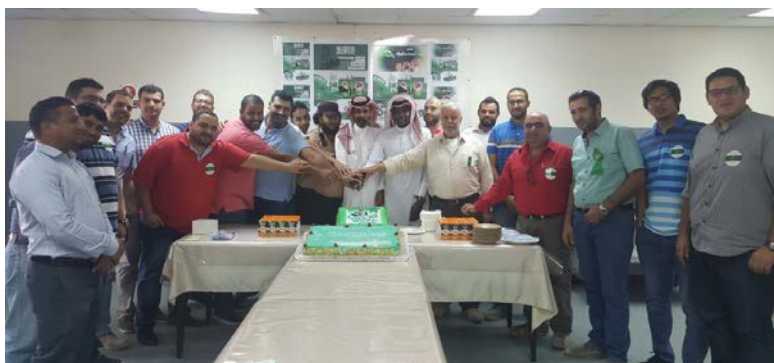
Nesma & Partners - DIRAB Airbase Project