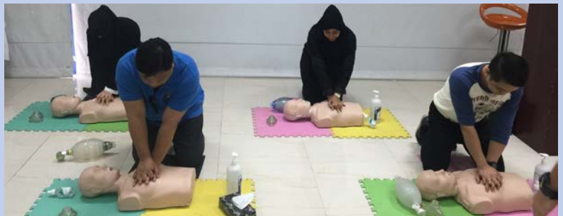
A Life Support and CPR session was conducted for Nesma Trading employees to provide them with the needed training in response to life threatening medical emergencies.