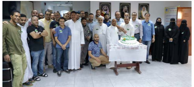
Namma International Marine Services