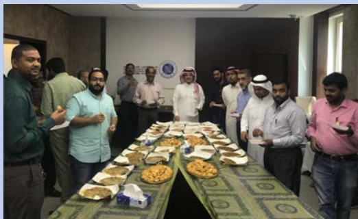
Eid al-Adha celebration at Nesma Electric.