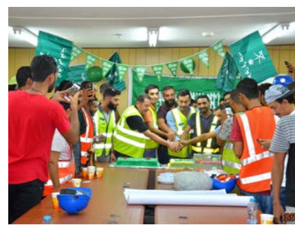
Nesma & Partners - SANG, Riyadh