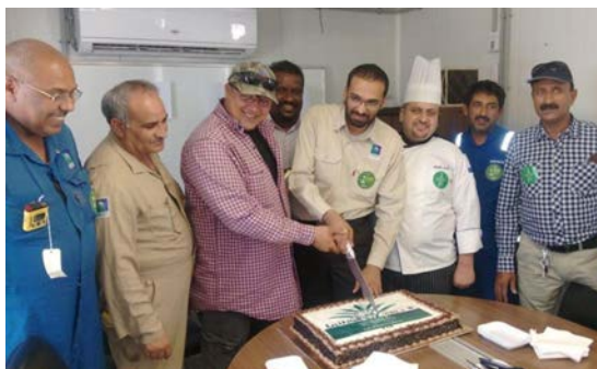
Nesma Catering - Schlumberger Project