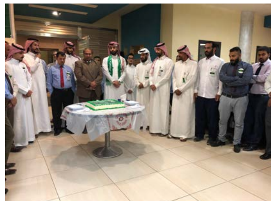
Namma Cargo, Riyadh