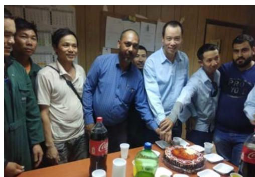
Nesma & Partners - SANG Hospital, Qassim