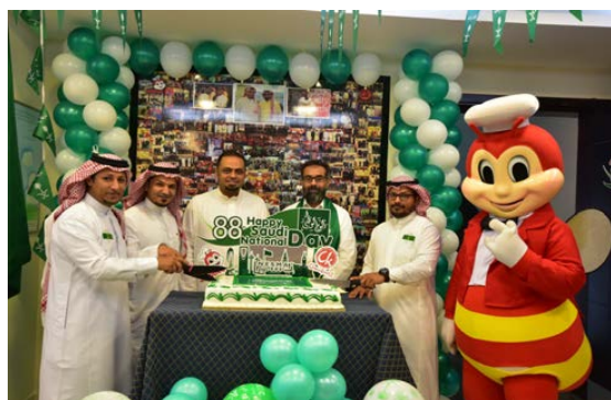
Nesma United / Jollibee