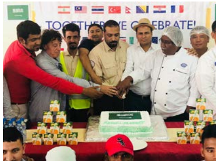
Nesma & Partners - Fadhilli Camp