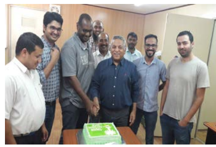
Nesma & Partners - KASC Project