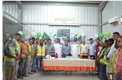
Nesma & Partners - KAFCO, Riyadh