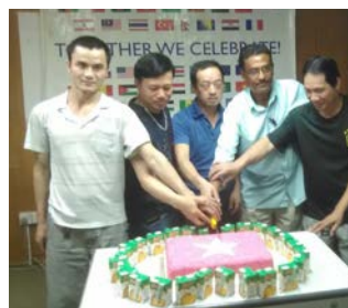
Nesma & Partners - SANG Hospital, Jeddah