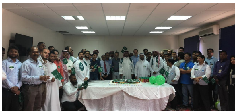
Nesma Telecom & Technology