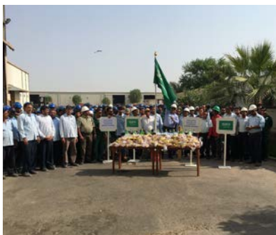
Nesma Fab Shop, Dhahran