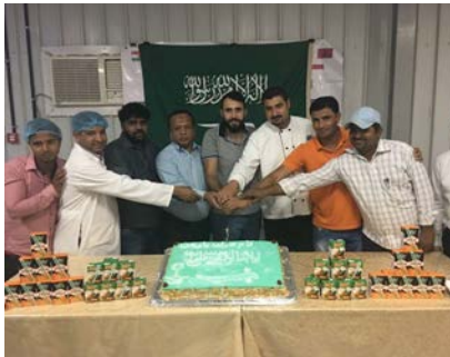
Nesma & Partners - Nammar Valley Camp

Across Nesma, employees recently celebrated the national day of Saudi Arabia