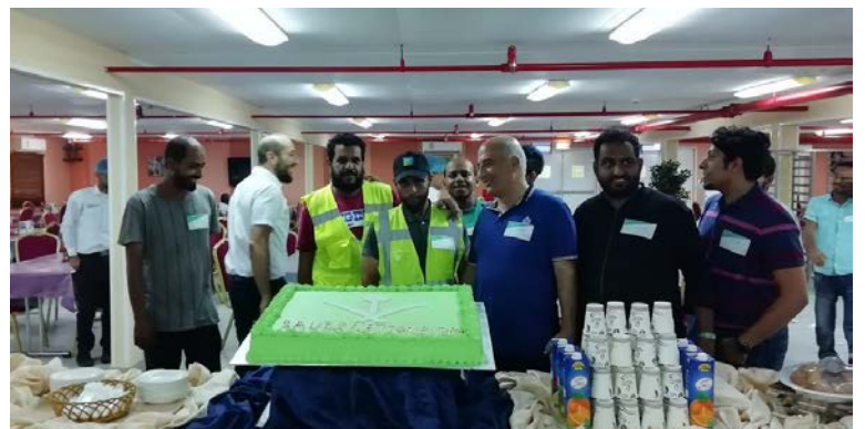
Nesma Trading, Jazan