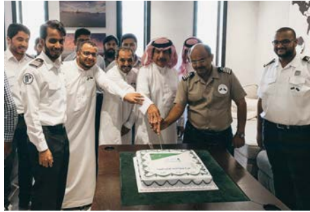
National Port Services