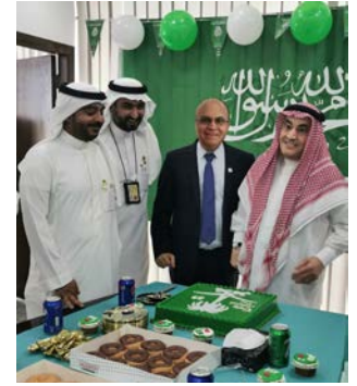
Nesma Security, Head Office