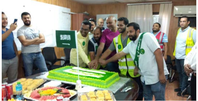
Nesma & Partners - SANG Hospital Project , Taif