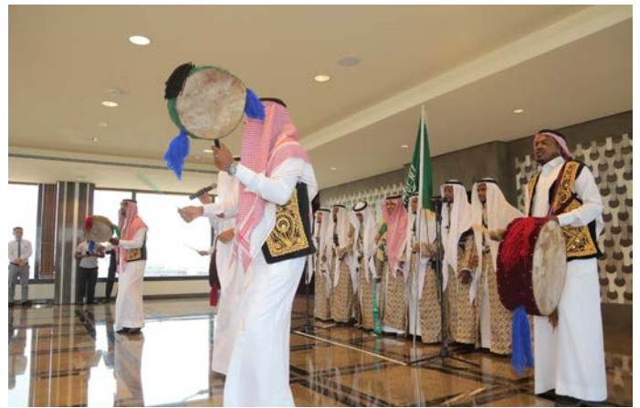
Nesma Holding, Jeddah