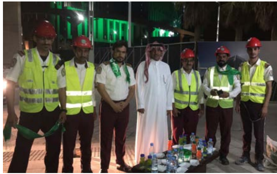
Nesma Security - KAFD Project