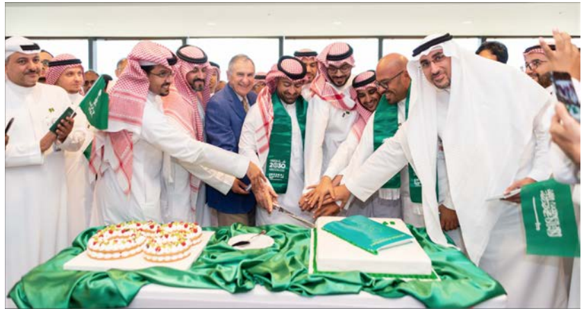
Nesma Holding, Jeddah

During Nesma Holding's celebration, a Nesma passport was distributed to document Nesma's presence across the Saudi Kingdom.