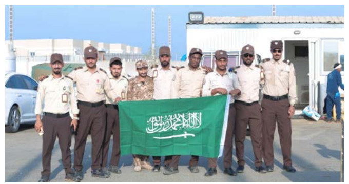
Nesma Security - Jazan Economic City Project