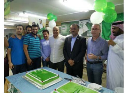
Nesma & Partners - KAAR Project