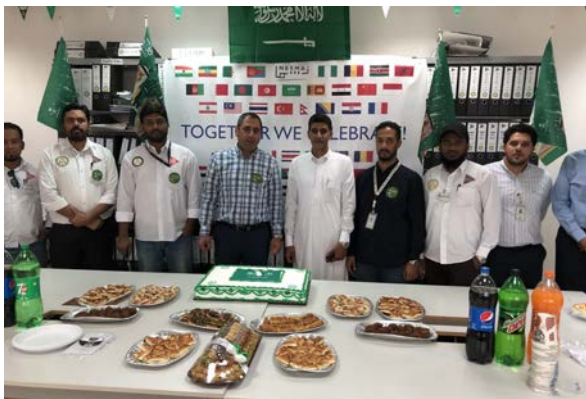
Nesma Trading - KSBAU Project