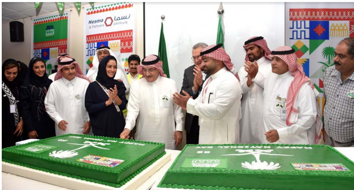
Nesma & Partners and Nesma Trading, Dammam