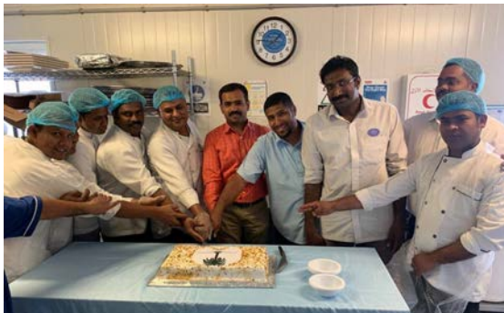
Nesma Catering – Schlumberger Project