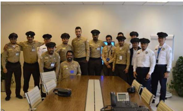
Nesma Security - KAPSARC Project