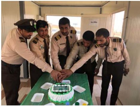
Nesma Security - Waad Al Shamal