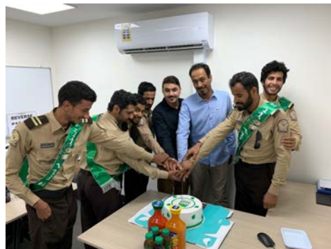
Nesma Security - NEOM Project