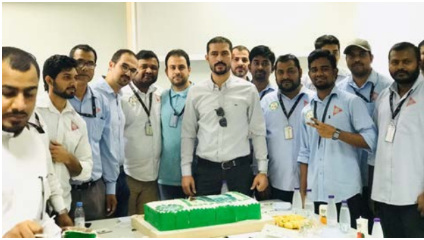
Nesma Trading - FMD Division