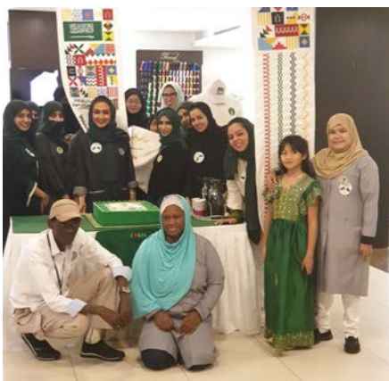
Nesma Embroidery, Jeddah