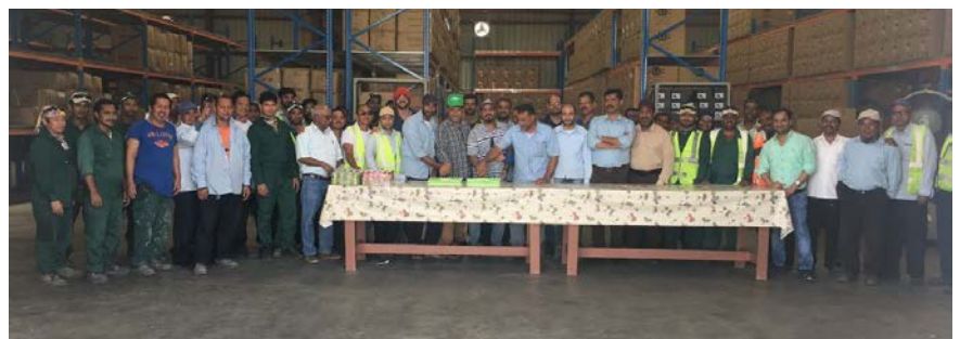
Nesma & Partners, Central Warehouse