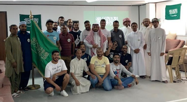
Nesma & Partners - OMP Project