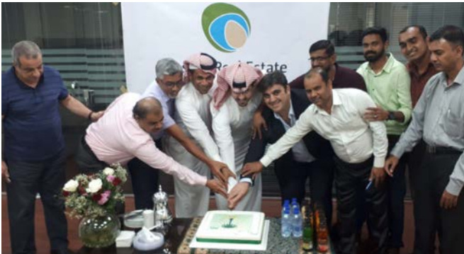
Nesma Real Estate