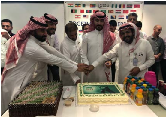
Nesma Telecom & Technology