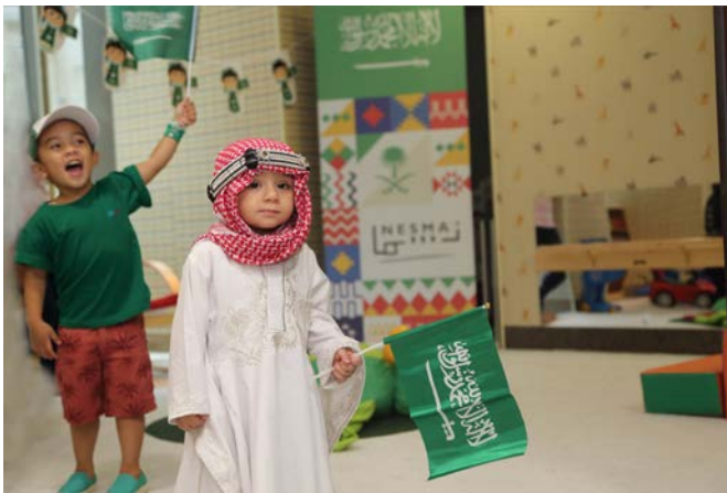
Nesma Holding daycare, Jeddah