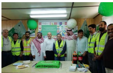
Nesma & Partners - KAFD Project