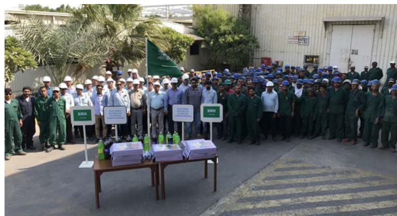
Nesma Fab Shop, Dhahran