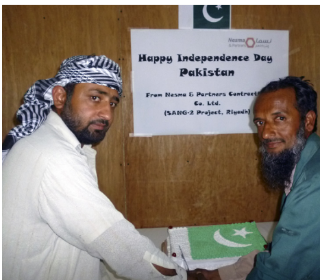
Nesma & Partners, SANG.