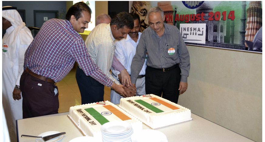
Nesma Trading, Khobar.