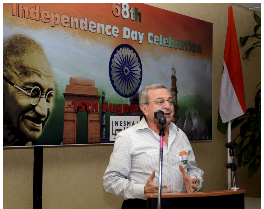
Nesma & Partners, Khobar.