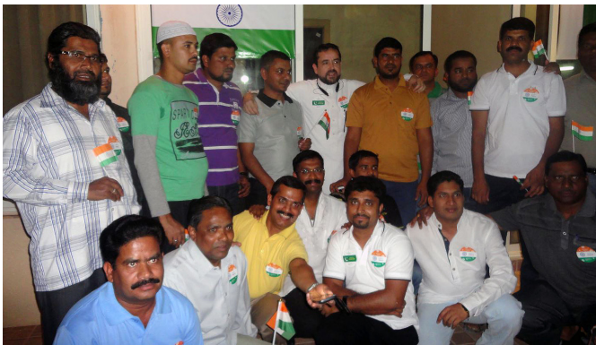
Nesma Telecom & Technology, Riyadh.