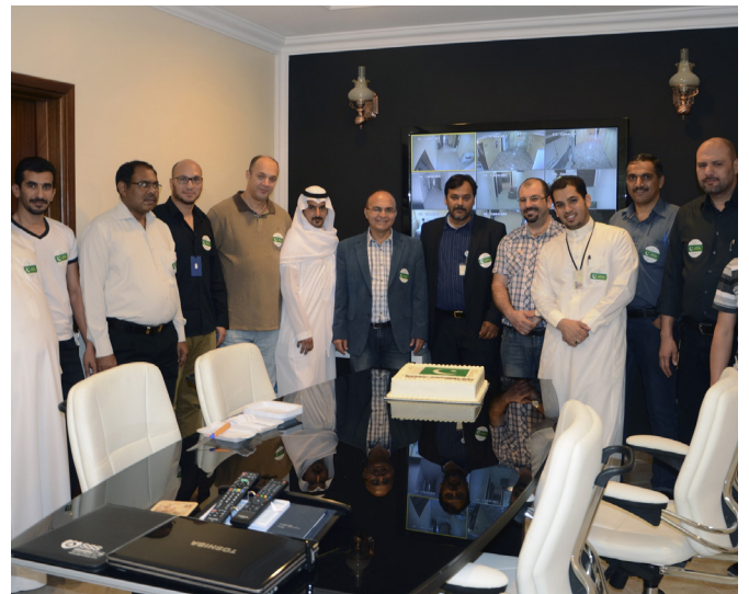
Nesma Recycling, Riyadh.