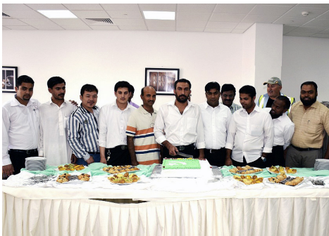
Nesma & Partners, Metro.