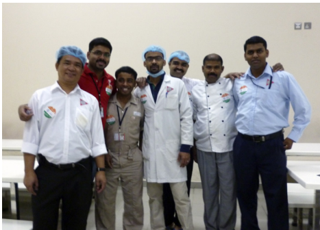
Nesma Trading, Deportee Camp.