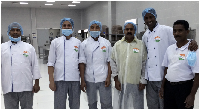
Nesma Chocolate, Jeddah.