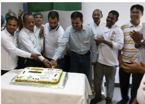
Nesma Trading, Jubail.