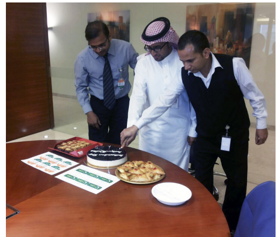
Nesma Holding, Riyadh.