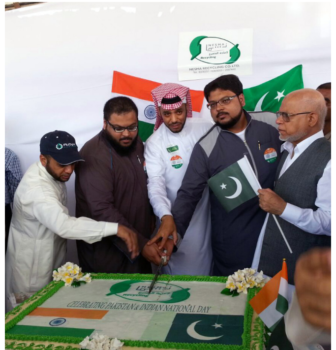
Nesma Recycling, Riyadh.