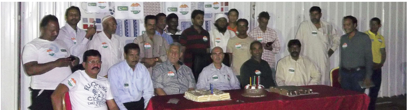
Nesma Telecom & Technology.