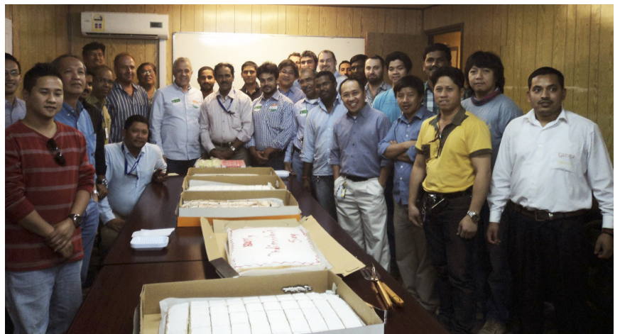
Nesma & Partners, Nylon.