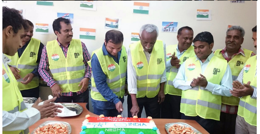
National Port Services (NPS).