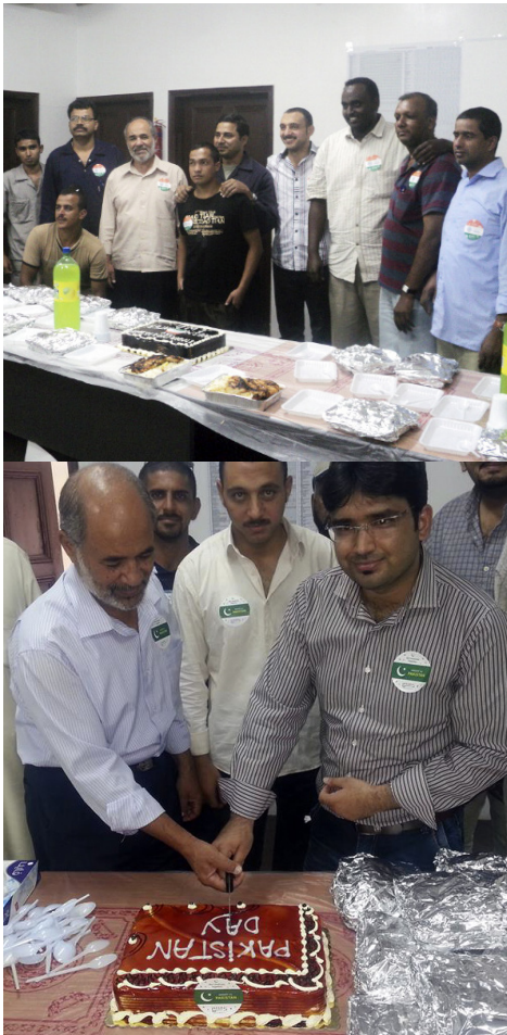
Nesma Water & Energy.