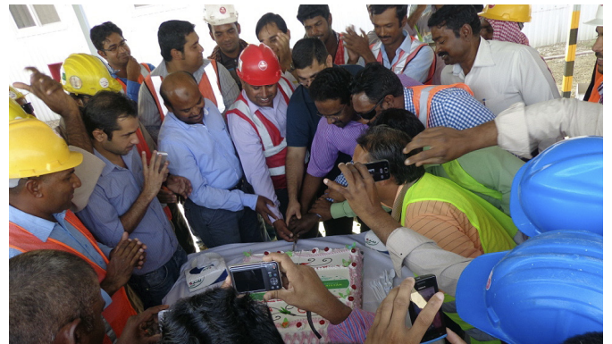
Nesma Telecom & Technology, Jubail.