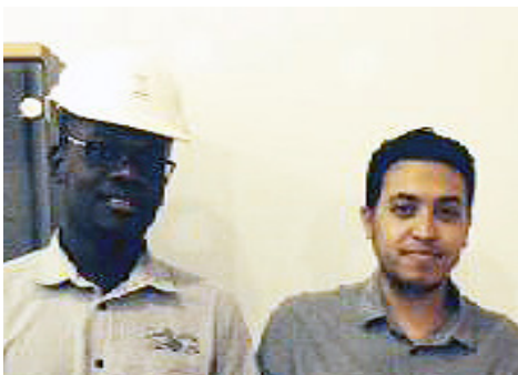
Nesma & Partners, Niger celebration.