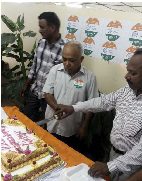
Nesma Trading, Manifa.