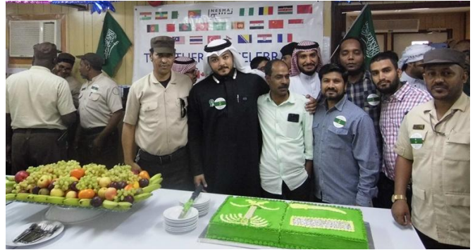
Nesma & Partners - KAAR Project