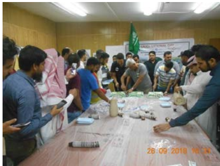
Nesma & Partners - SANG Hospital, Qassim