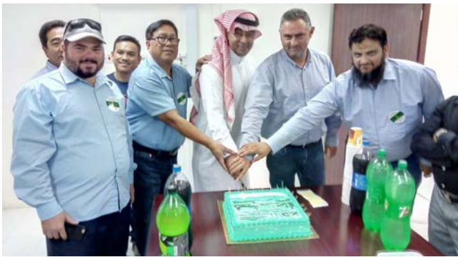
Nesma & Partners - PC-IWWP Project, Ras Al Khair