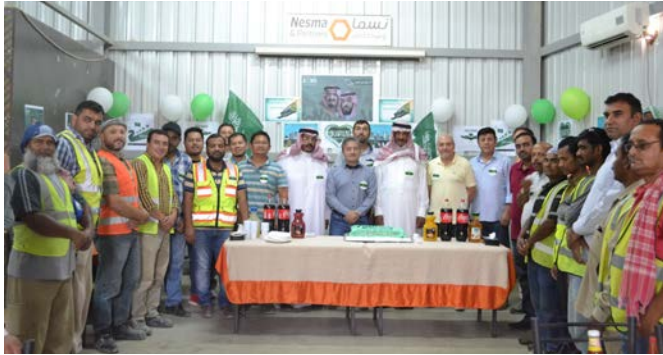
Nesma & Partners - KAHD Project

Across Nesma, employees recently celebrated the national day of Saudi Arabia