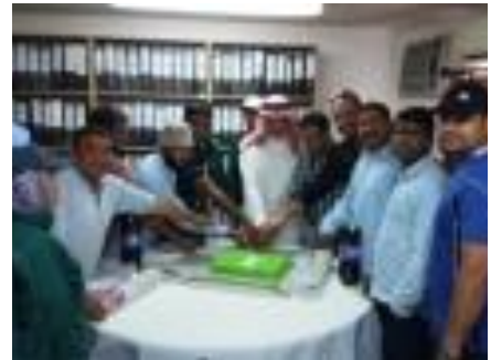
Nesma & Partners - Dahran Main Camp

Employees recently celebrated the national day of Nigeria at Nesma & Partners - KAAR Project