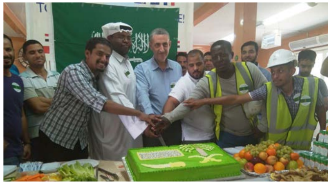
Nesma & Partners - SANG Hospital, Jeddah