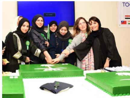
Nesma & Partner and Nesma Trading