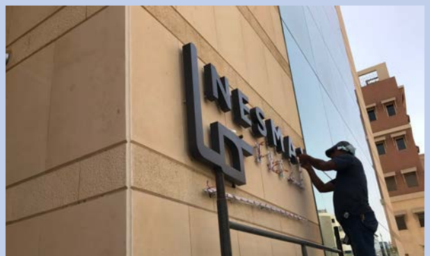
Nesma Holding recently updated signage.