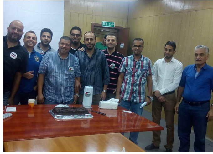
Nesma & Partners - KAUST Innovation Center, Thuwal