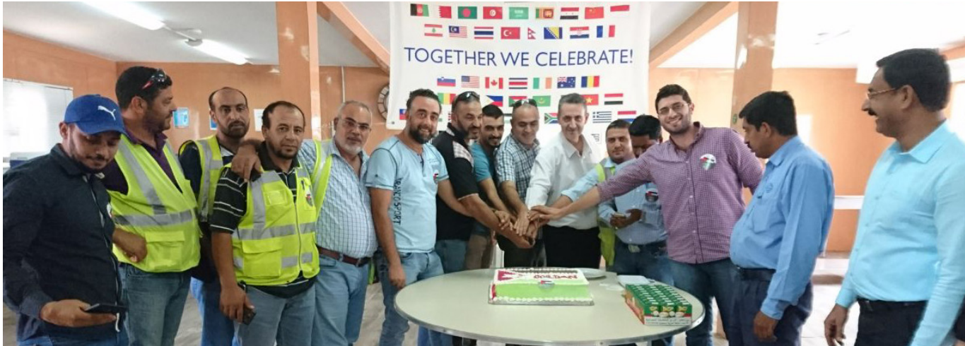
Nesma & Partners - SANG Hospital, Jeddah