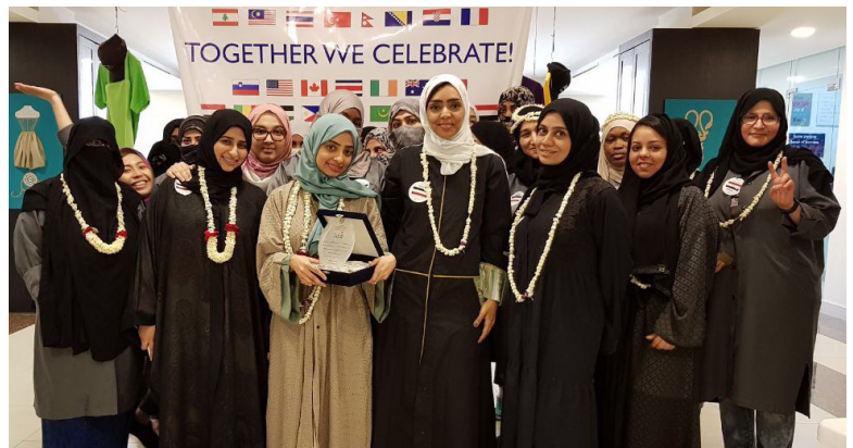
Nesma Embroidery, Jeddah