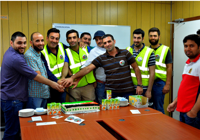
Nesma & Partners - SANG Hospital, Riyadh