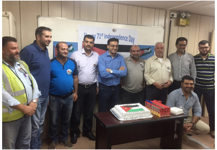
Nesma & Partners - DIRAB Airbase Project