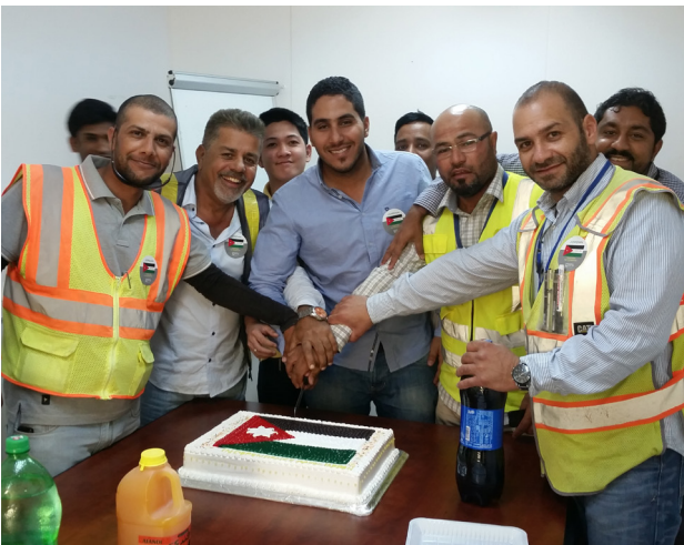
Nesma & Partners - Fadhili Project