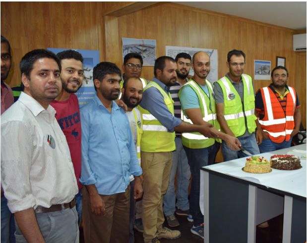
Nesma & Partners - SANG Hospital, Taif