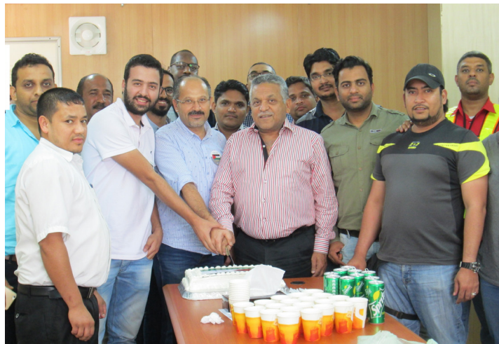
Nesma & Partners - KASC Project