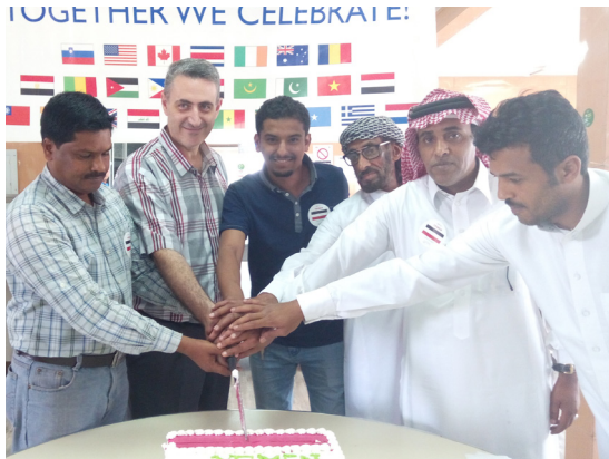
Nesma & Partners - SANG Hospital, Jeddah