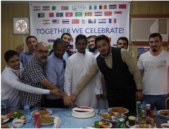
Nesma & Partners - KAAR Project

Across Nesma, employees recently celebrated the national day of Yemen.