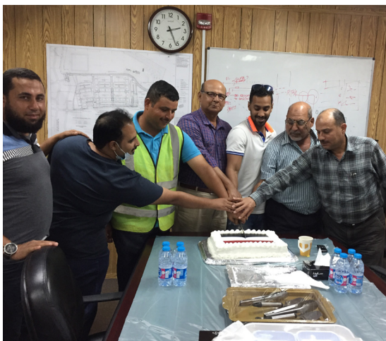
Nesma & Partners - KAUST New Student Housing, Thuwal