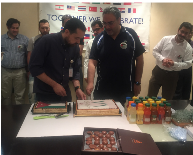
Nesma Telecom & Technology