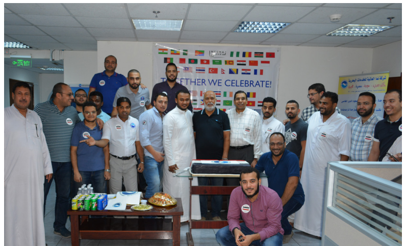
Namma Shipping, Jeddah