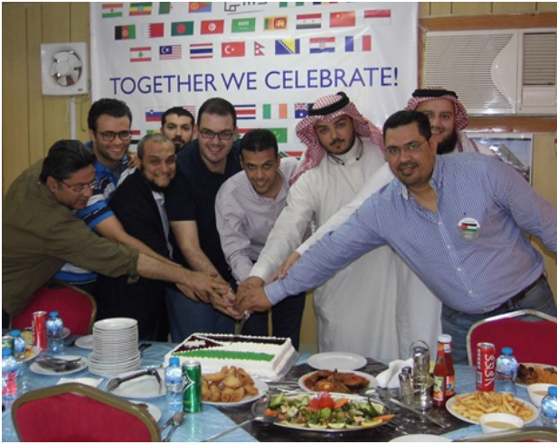
Nesma & Partners - KAAR Project

Across Nesma, employees recently celebrated the national day of Jordan.