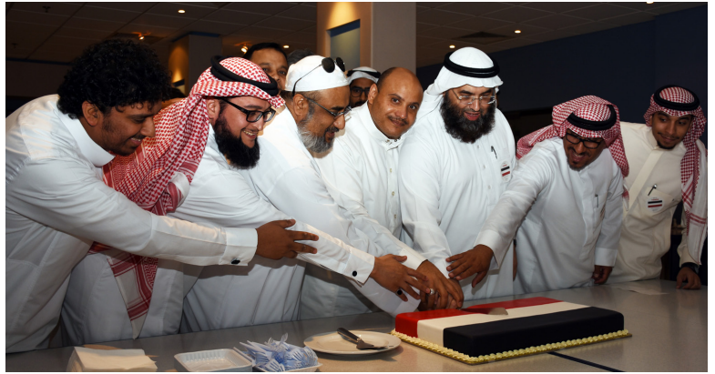
Nesma & Partners - Head office, Khobar