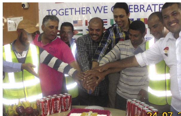
SANG Hospital Project