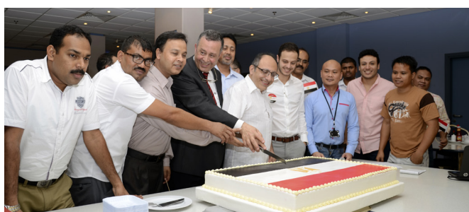
KAUST Building Renovation & Housing Project