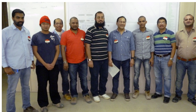
Dirab Air Base