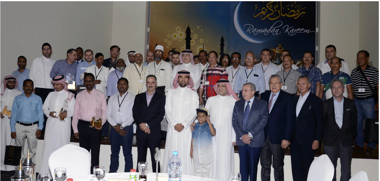
Nesma & Partners, Khobar