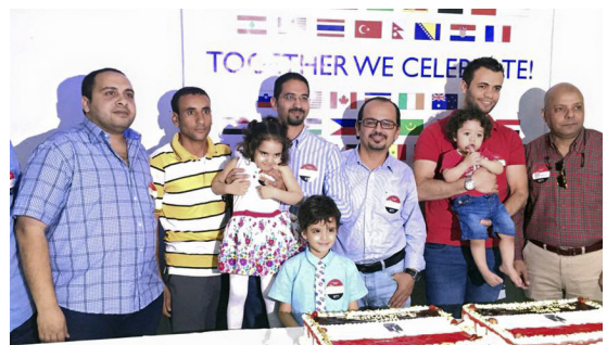
JODP & Shumaisy Camp