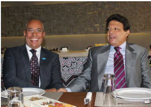
Namma Cargo, Riyadh

Some images from the yearly Iftar gatherings throughout Nesma Group companies.