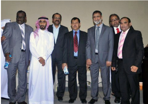
Namma Cargo, Riyadh

Some images from the yearly Iftar gatherings throughout Nesma Group companies.