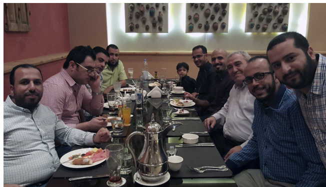
MEP Engineers at JODP Project