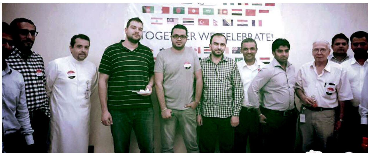
Nesma Telecom & Technology