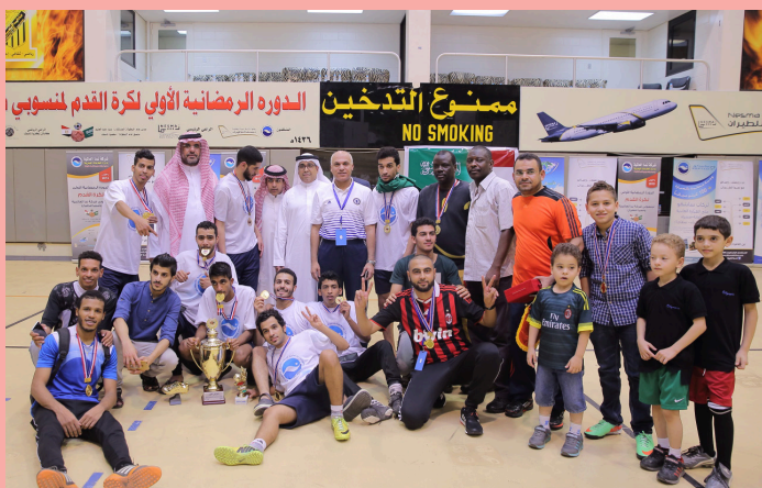
Participants at the recent Namma Football Tournament.