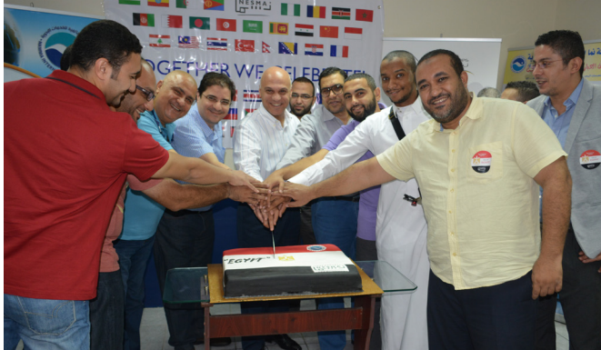
Namma International Marine Services

Pictures from National Day celebrations.