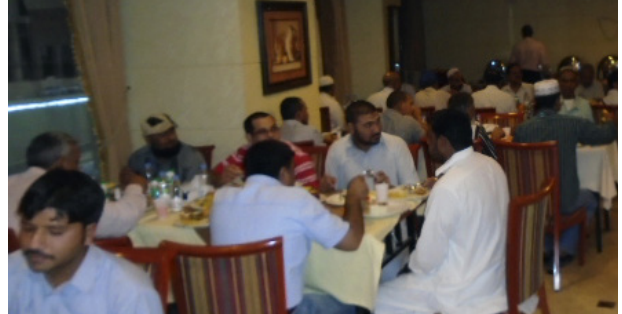
Bathel Al Khair Project