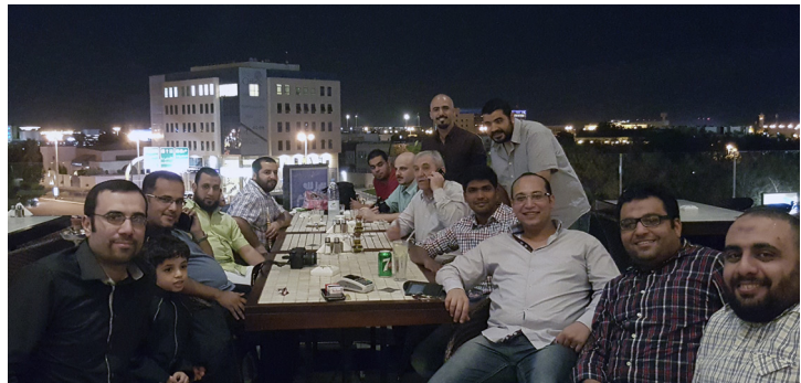
Nesma & Partners