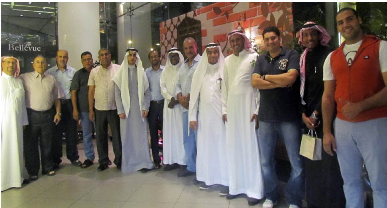
Nesma Water & Energy