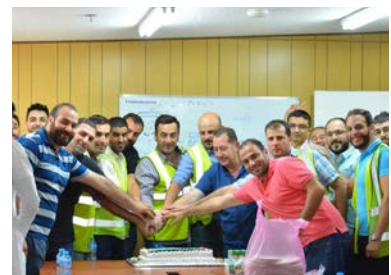
Nesma & Partners - SANG Hospital Project, Riyadh.jpg

Across Nesma, employees recently celebrated National day of Syria