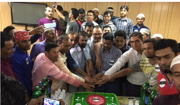
Nesma & Partners - SANG Taif project camp