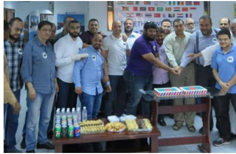
Namma International Marine Services