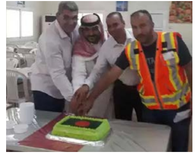
National Container Terminal