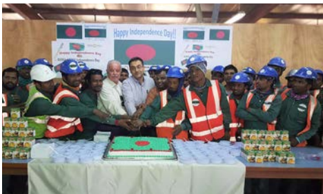
Nesma & Partners - DIRAB Airbase project