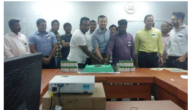
Nesma & Partners - PMO project, Riyadh