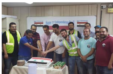
Nesma & Partners - DIRAB Airbase Project

Across Nesma, employees recently celebrated National day of Syria