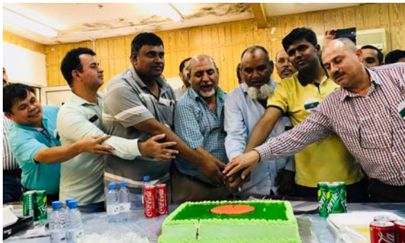
Nesma & Partners - KNHP project