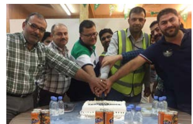
Nesma & Partners - KAUST New Student Housing Project