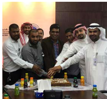
Nesma Electric, Jeddah