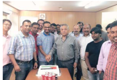
Nesma & Partners - KASC Enhancement project

Across Nesma, employees recently celebrated Land Day of Palestine