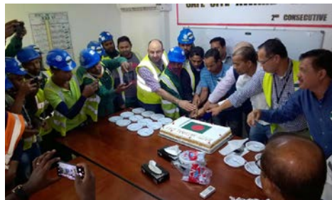
Nesma & Partners - FIB & FCW projects