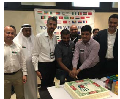
Nesma Telecom & Technology