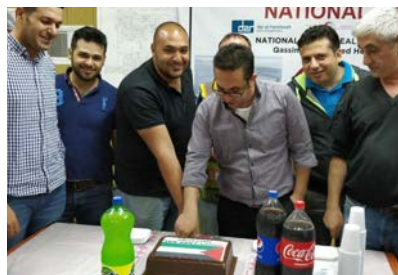
Nesma & Partners - SANG Hospital project, Qassim