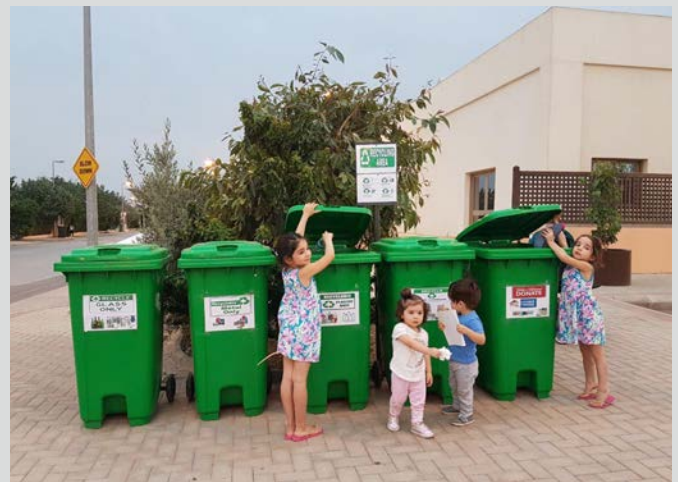
Nesma Oasis Village started a recycling initiative in Riyadh.

https://www.youtube.com/watch?v=2oaNYJNFzkU