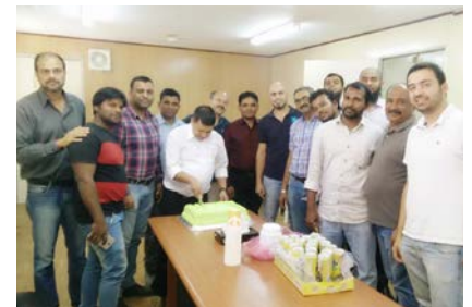
Nesma & Partners - KASC