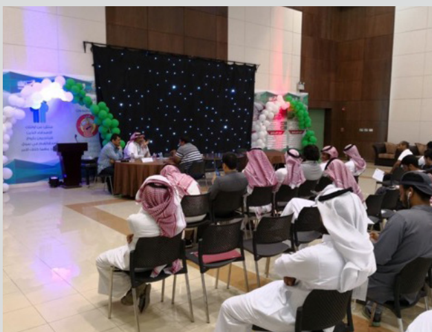
A team from Nesma Water and Energy participated in a career day at Jeddah Technical College.