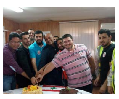
Nesma & Partners - Sang Hospital, Taif