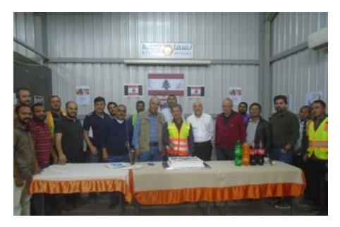
Nesma & Partners - KAFD Project