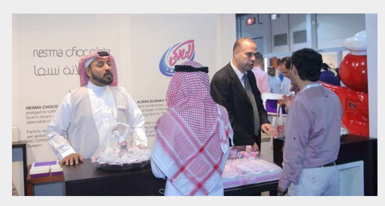
Nesma United Participates in Foodex Saudi Jollibee, Chowking, Alban Almalky, and Nesma Chocolate participated in the recent food and drink trade exhibition, Foodex Saudi.