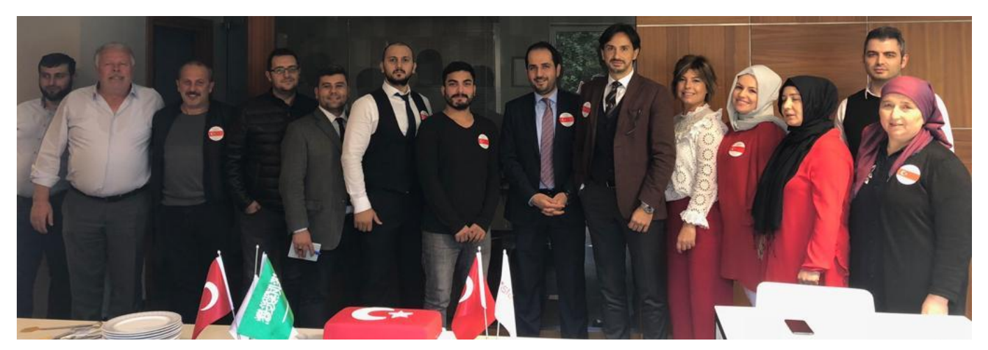
Istanbullines, Istanbul, Turkey