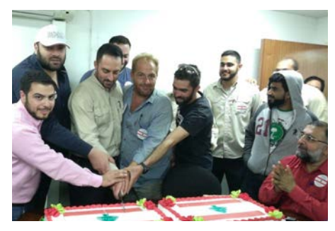
Nesma & Partners - Onshore Maintain Potential Project