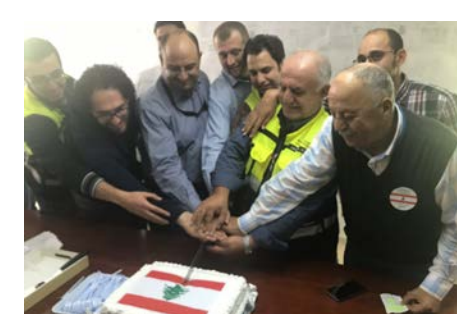
Nesma & Partners - FIB & FCW projects

Across Nesma, employees recently celebrated the national day of Lebanon