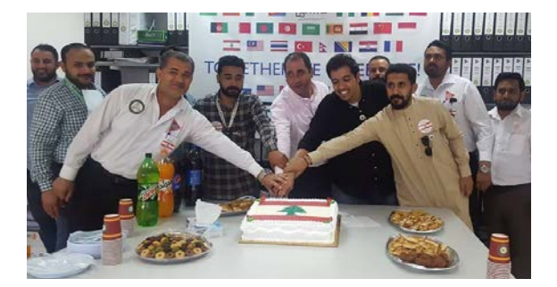
Nesma Trading - KSBAU-HS O&M Project, Jeddah