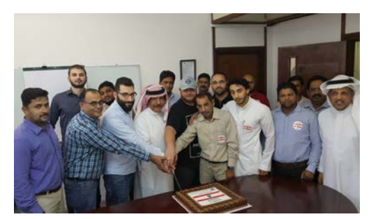
National Port Services, Jubail