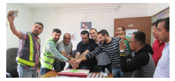
Nesma Trading - Dhahran Project