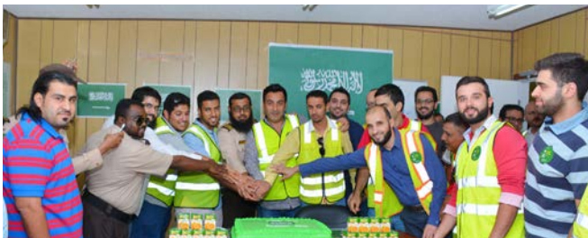
Sang Hospital, Riyadh