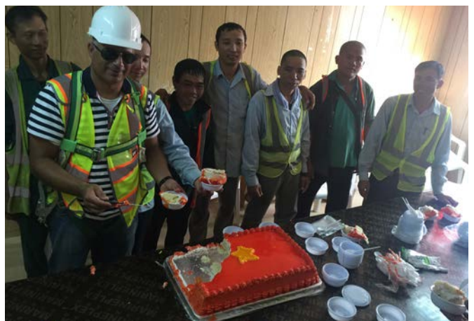
Vietnam - Nesma & Partners, KAUST Innovation Center Project