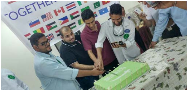
Nesma Catering - Nesma Jubail Camp 2