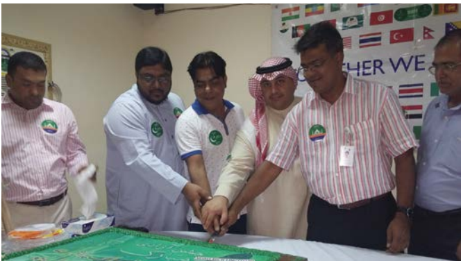
Pakistan - Nesma Recycling