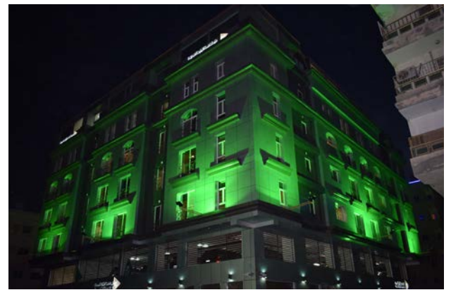
Nesma Trading, Head Office, Khobar