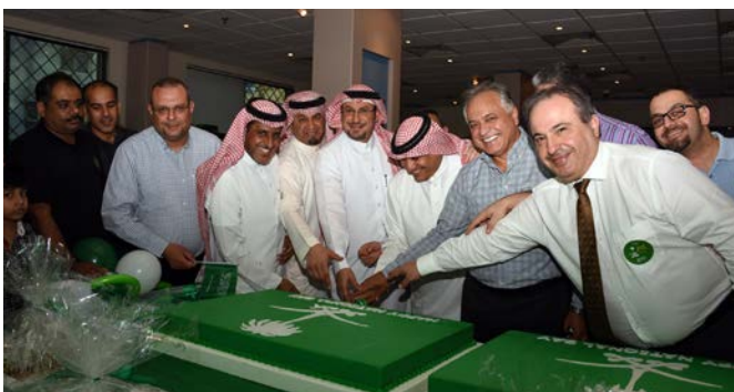
Nesma & Partners and Nesma Trading, Khobar