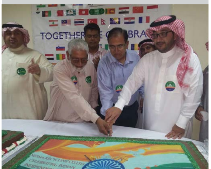
India - Nesma Recycling