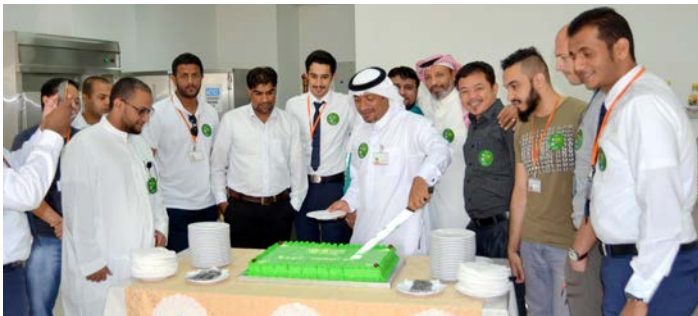
Nesma & Partners, Riyadh Metro Project