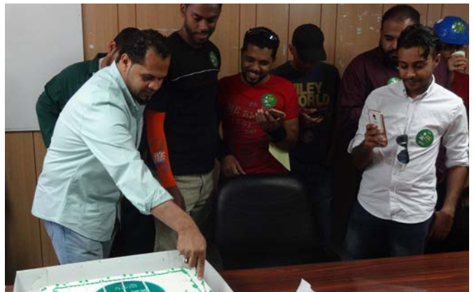
Sadara SPC Project