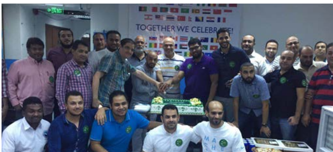
Namma International Marine Services