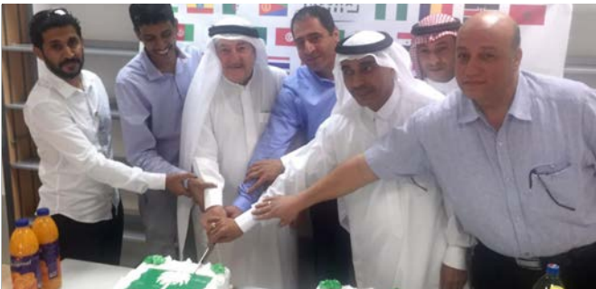
Nesma Trading - FMD-KSAU-HS