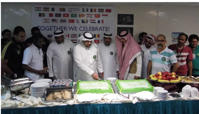
Jabal Omar Development Project