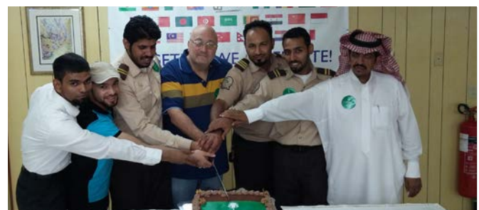
Nesma Catering, Nesma Palms Compound, Jubail