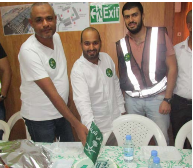
SANG Hospital, Taif