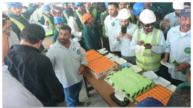
Nesma & Partners, Jubail Bulk Plant