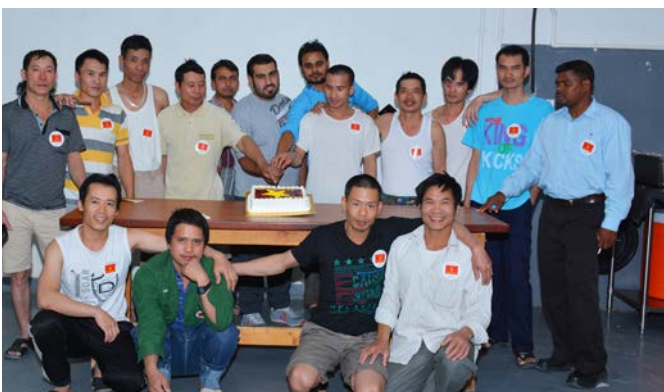
Vietnam - Nesma & Partners, SANG Hospital, Riyadh