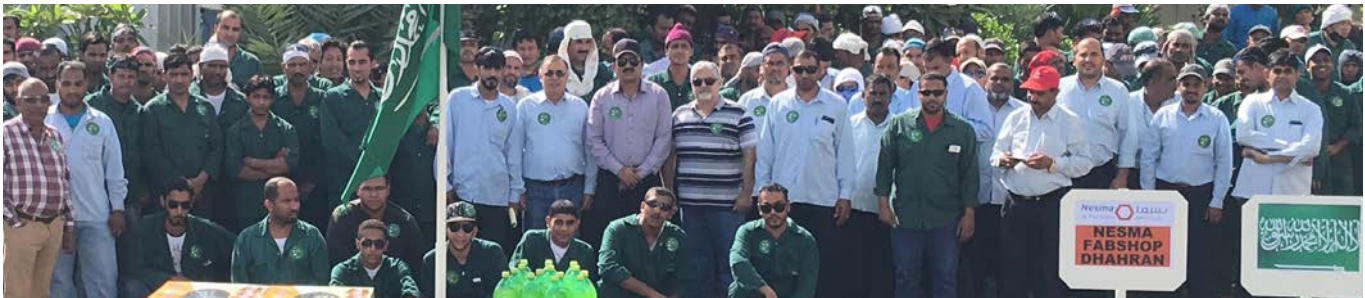
Nesma Fab Shop, Dhahran