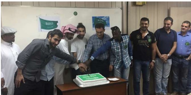
Dirab Airbase, Riyadh