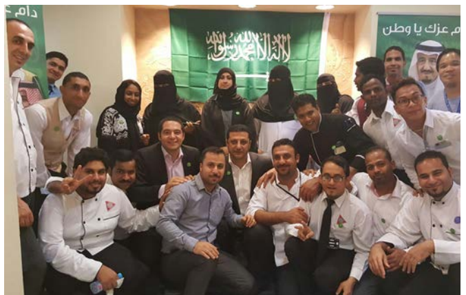
Nesma Catering, Rastanura