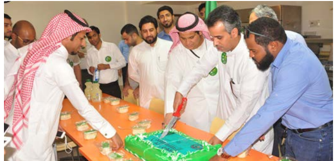
Nesma Training Institute, Dhahran