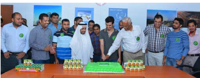
SANG Hospital PMO