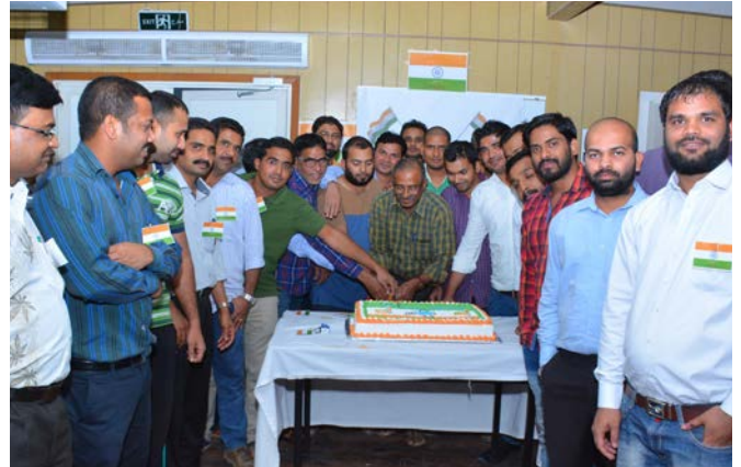
India - Nesma & Partners, SANG Hospital Riyadh