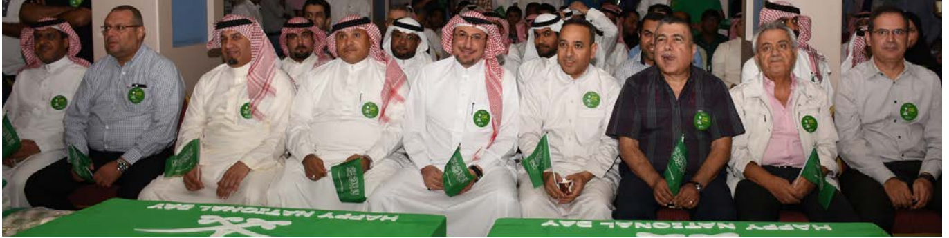
Nesma & Partners, Head Office, Khobar

Across Nesma, employees recently celebrated the national day of Saudi Arabia with their colleagues.