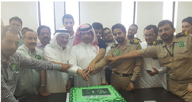
National Port Services Company