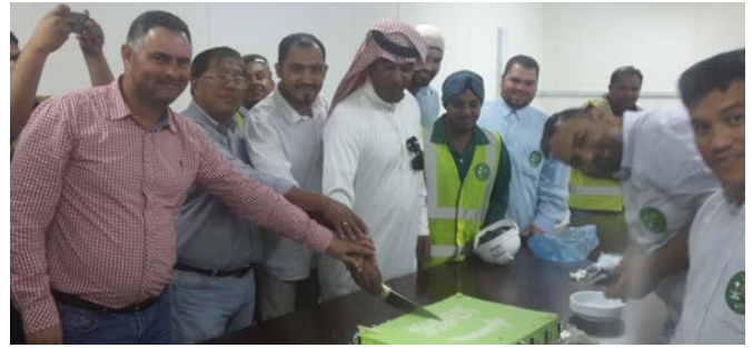
Nesma & Partners, WWTP