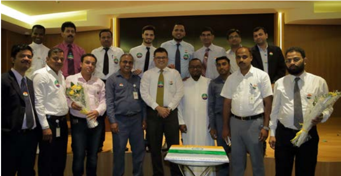
India - Nesma Holding

Across Nesma, employees recently celebrated several national days with their colleagues from Vietnam, India, and Pakistan.