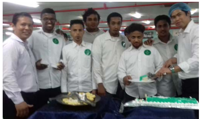
Nesma Catering, Jazan Aramco Catering