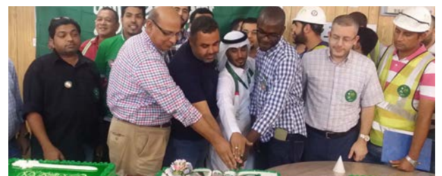
KAUST New Housing Project