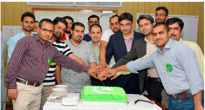
Pakistan - Nesma & Partners, SANG Hospital, Riyadh