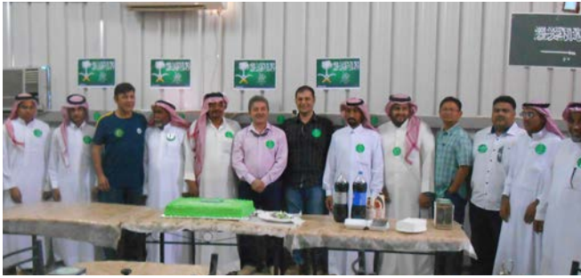
Nesma & Partners, KAFD project, Riyadh