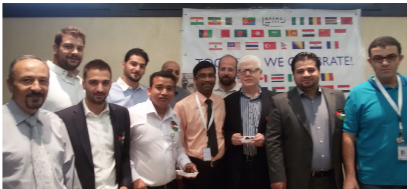
Nesma Telecom & Technology