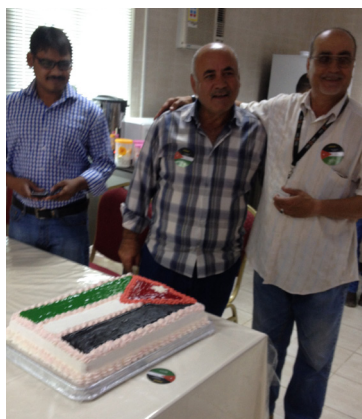
Nesma & Partners