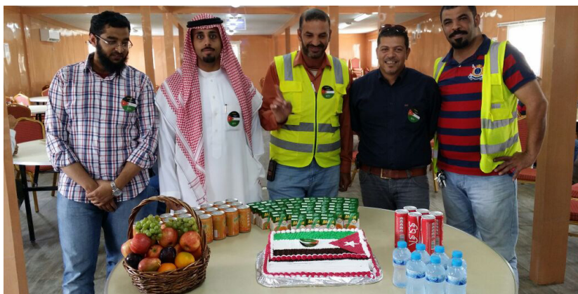
Nesma & Partners