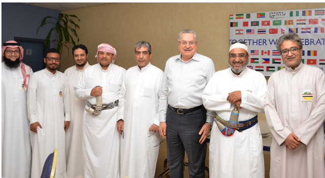
Nesma & Partners