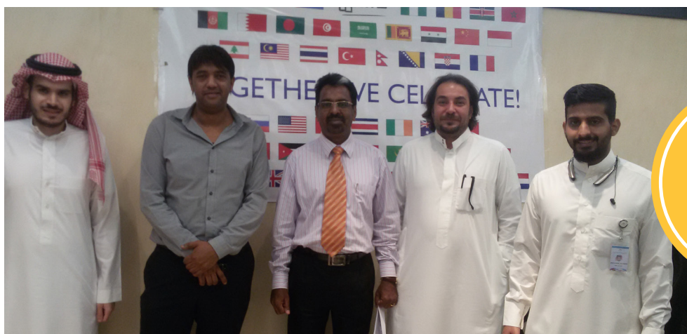
Nesma Telecom & Technology