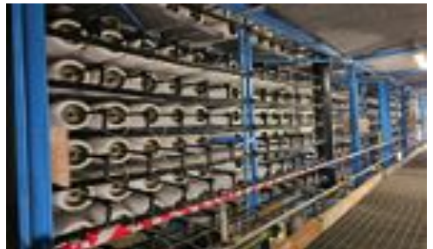
Jubail 3 Water Plant