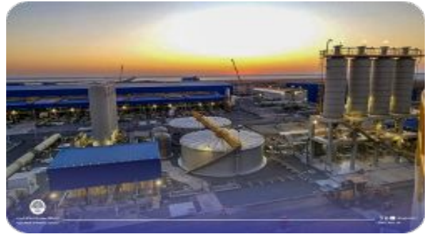
Yanbu 4 Water Plant

The SAR 2.6B Jubail 3B project utilizes a 61MW solar array and was completed in just 28 months. The plant can produce around 570,000 m3 of potable water daily for the cities of Jubail and Dammam. Nesma also has a 30% stake in this consortium with Engie and Al-Ajlan working with EPC contractors Acciona, Sepco III and Power Construction Corp.