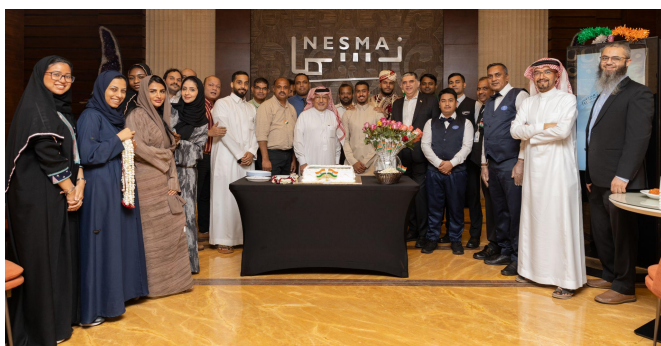
Nesma Co. Headquarters , Jeddah