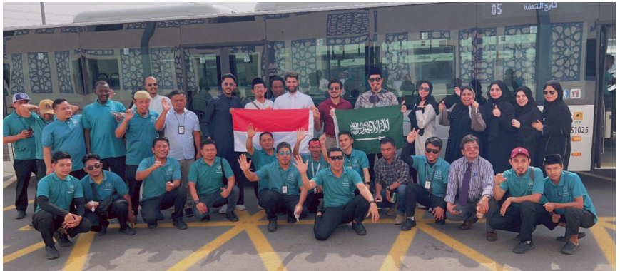
Modern Bus Co.