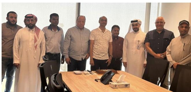
Namma International Marine Services Company