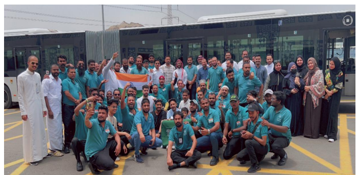
Modern Bus Co.