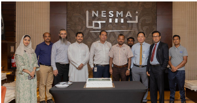
Nesma Co. Headquarters , Jeddah