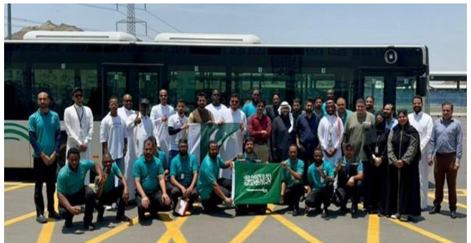
Modern Bus Co.