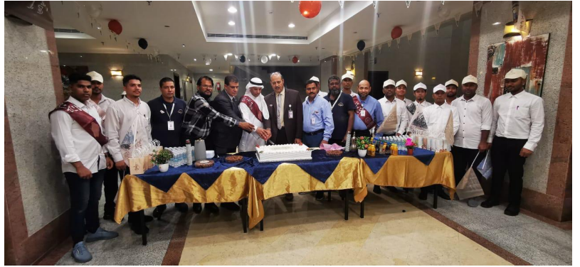
Namma Mawaddah Hotel, Makkah