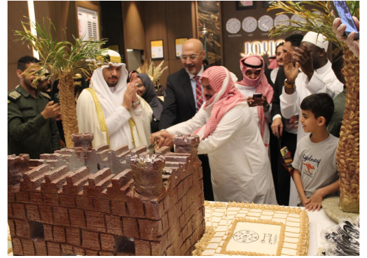
Jayden Hotel, Al Madinah