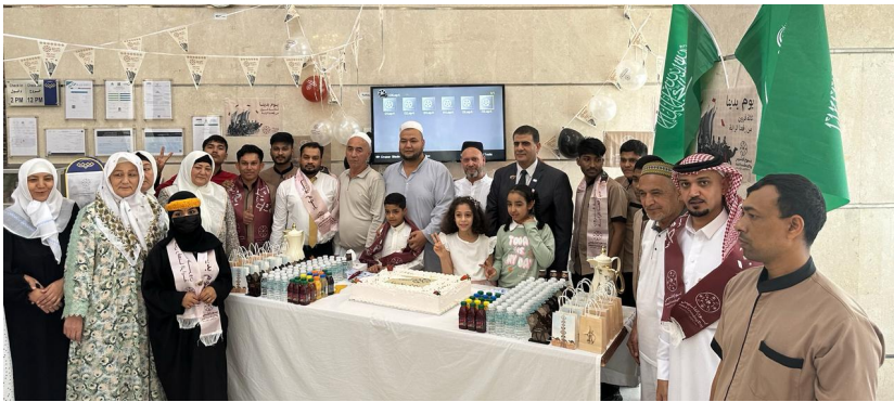
Al Barakah Mawaddah Hotel, Makkah