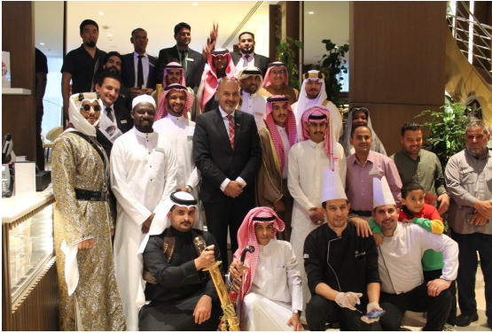
Jayden Hotel, Al Madinah