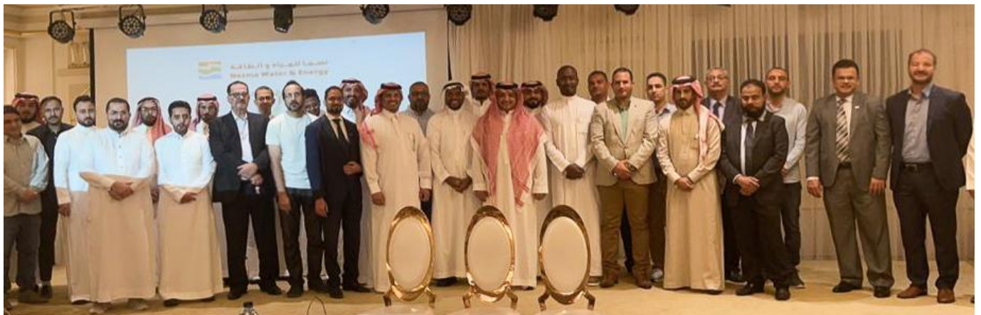
Nesma Water & Energy Ramadan party April 16th, 2023. NW&E also celebrated its 12th anniversary.