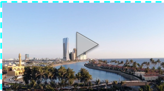
Nesma Infrastructure & Technology Jeddah Annual Ramadan Iftar