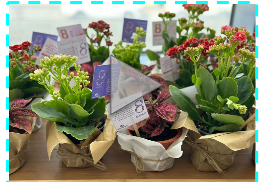
Modern Bus celebrated International Women's Day Click here or on the image to play the video.