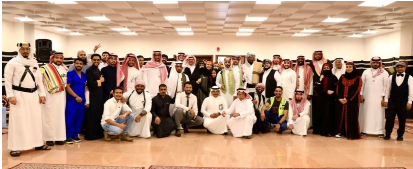
Modern Bus celebrated Saudi Founding Day